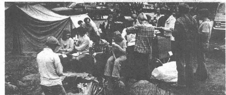
CLUB CAMPING TRIP — A group of Ambassador College students take a meal break on a weekend camping trip to Sequoia National Park.