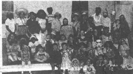
COSTUME PARTY — Children ages 3 through 13 of the Montgomery, Ala., church model the costumes they conjured up for the children's costume party March 17. After refreshments and some magic tricks, the children viewed several Laurel and Hardy and Little Rascal movies.

Reports for "Local Church News" must be postmarked no later than 14 days after the date of the event reported on and be no longer than 250 words. Reports lacking the date of the event cannot be published.