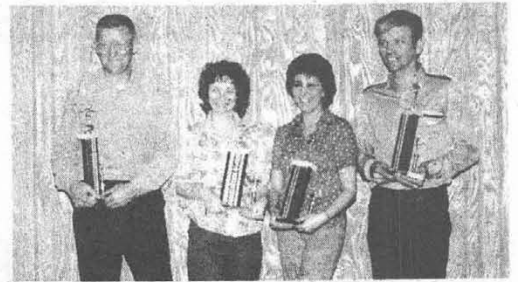
BOWLING CHAMPS — Members of the Long Island, N.Y., A bowling team display the trophies they won after defeating the Manhattan, N.Y., A team for the championship in the Philadelphia, Pa., invitational handicap bowling tournament April 1. (See "Sports," this page.)