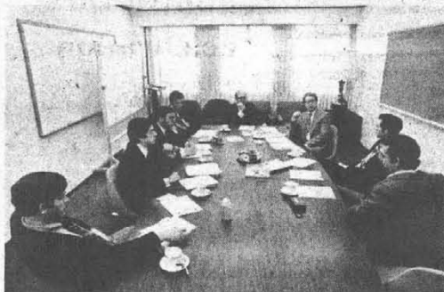
PLANNING SESSION — Worldwide Church of God and Ambassador International Cultural Foundation (AICF) employees discuss plans with a Special Olympics representative.