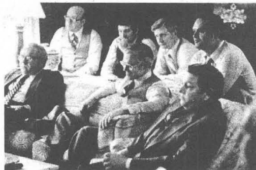
TUCSON MEETING — Above: Ministers attending the area coordinators' meeting March 21 at Herbert Armstrong's Tucson, Ariz., home listen intently. Below: Mr. Armstrong speaks to the ministers about their responsibilities as area coordinators.

tion concerning the coordinators' calling as leaders in the ministry. He emphasized that they were bond slaves of Jesus Christ, that they were to be humble servants in Christ's ministry, dedicating their lives to building and strengthening God's Church and Work.