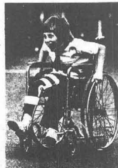
SPECIAL OLYMPICS — A handicapped youngster competes in a race in the Special Olympic Games.

The mentally retarded have always been told what they can't do. Special Olympics says: "You can do it. All you need is a chance." The Ambassador foundation is happy to have a part in giving that chance to thousands of mentally handicapped persons both here and abroad.