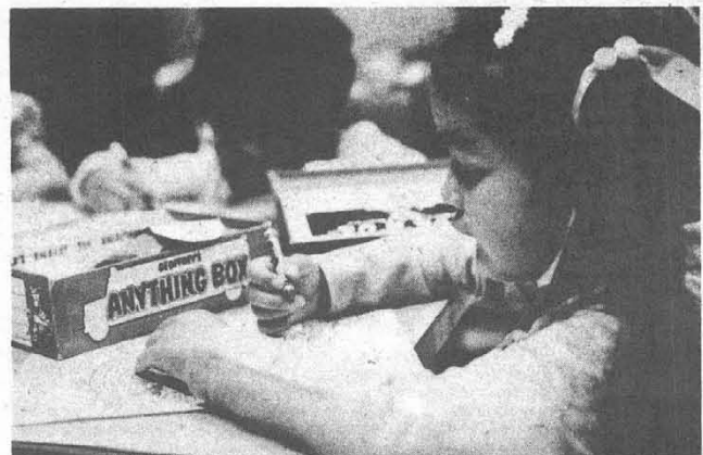
Crayon in hand, a student contemplates her Sabbath-school assignment.