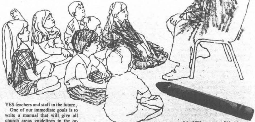
YES teachers and staff in the future.

We have completed a systematic master file of all YES materials. The master file contains two basic divisions, one of which deals strictly with curriculum related materials. In this division we have developed a subject file based on the order of topics and events in both the Old and New Testaments. Any YES materials received from the field can now be classified immediately and will be at the fingertips of writers who need