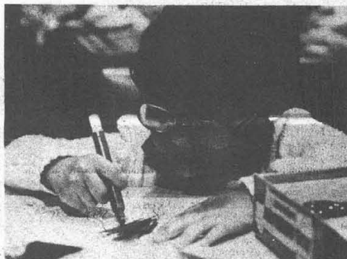
SABBATH SCHOOL — A YES student from the Pasadena Spanish church begins to color his class project, a pictorial representation of a biblical event.