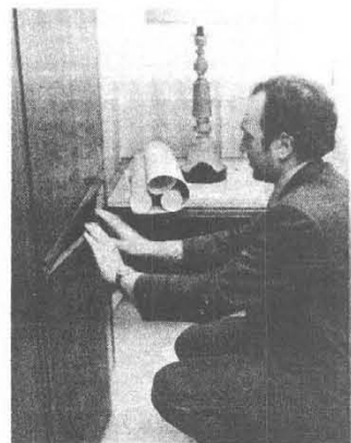
EXECUTIVE SUITE — Above: An attorney for the State of California searches for records in the executive office suite in the Church's Hall of Administration. Below: A locksmith changes the lock on a door to the Church's accounting department to safeguard records.