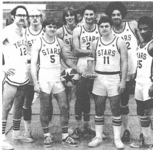
TROPHY WINNERS — The Toledo men's team came out the champions in its division at the Columbus invitational basketball tournament March 20. (See "Ohio Tournament," this page.)