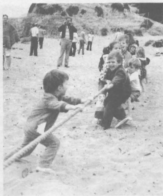
CHURCH PICNIC — Northern California's summer fog was late leaving this year, but high spirits, home-grown barbecued lamb and a tug-of-war in the sand, together with all the other fun, games and food, made a bright and sunny day of it Sept. 2 at the picnic of the churches from Fairfield and Santa Rosa, Calif. See story at right.