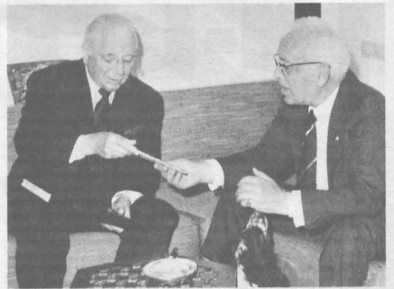
EXPLAINING AMBASSADOR COLLEGE — Mr. Herbert W. Armstrong discusses the aims and goals of Ambassador College with President Suleiman Franjeh of Lebanon and shows him certain college publications, including The Envoy.

Personally, I am very grateful to the Eternal God for the opportunity to be able to be borne aloft on the wings of the Falcon, a super-sophisticated, special-avionics fan-jet aircraft which has dual back-up fail-safe systems, just like airliners, and which embodies every conceivable safety factor modern space-age technology can provide. But even so, I always