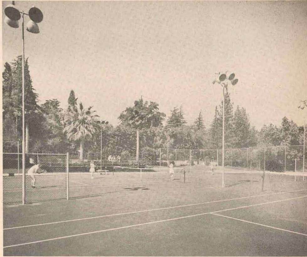
Tennis courts provide ample opportunity for physical exercise and social entertainment for Ambassador students.

Today "modern science," especially through biology, psychiatry, medicine and other so-called sciences, aided and abetted by the moral toboggan-slide, has swung the public attitude and the practise among juveniles to the opposite extreme. Today TIME magazine reports a "New Religion" in Europe from Paris—a religion of "emancipation" for women—a "religion" of unbridled immorality. Today a London newspaper in two feature articles exposes the "new freedom" in Sweden. A mother is quoted as saying she finally became a little dissatisfied finding a strange girl frequently in her kitchen in a bathrobe on arising of a morning; and, since her 20-year-old