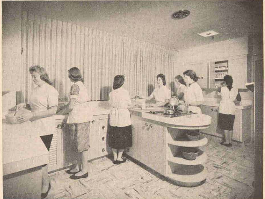
The Home Economics Department at Ambassador College, Pasadena, California, provides young women with ample facilities and training.

The Academy founded by Plato, some 350 years before Christ, gave instruction to men only. The pagan schools that dotted the Roman Empire in the first centuries after Christ were for men only. The Cathedral and the Monastic schools which replaced them after the 6th century admitted no women. The first universities at Salerno and Paris were attended only by men. When Oxford, Cambridge, Harvard, Yale and Columbia first were formed—and for some