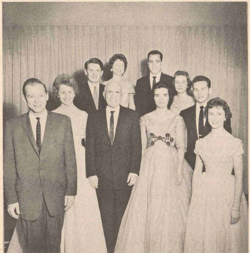
The Ambassador Octet provides cultural training for both young men and women.