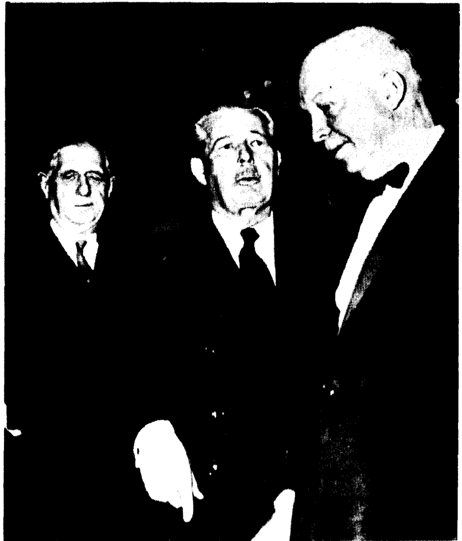
LAST DITCH EFFORTS FAIL —France's President Charles deGaulle, British Prime Minister Harold Macmillan and President Eisenhower, left to right, leave second conference among them at Elysee Palace in Paris. Their last attempt to save the summit conference with Soviet Premier Nikita Khrushchev ended in failure.

"Many times I had been trying to quit smoking and couldn't stop. I thought I