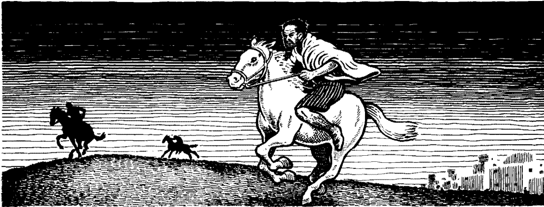
Messengers rushed to all parts of Goshen to tell the Israelites when to leave their homes and where to meet.

Passover, they were ready to leave when word came to them. But even before the word to leave arrived, their wailing Egyptian neighbors came knocking on their doors.