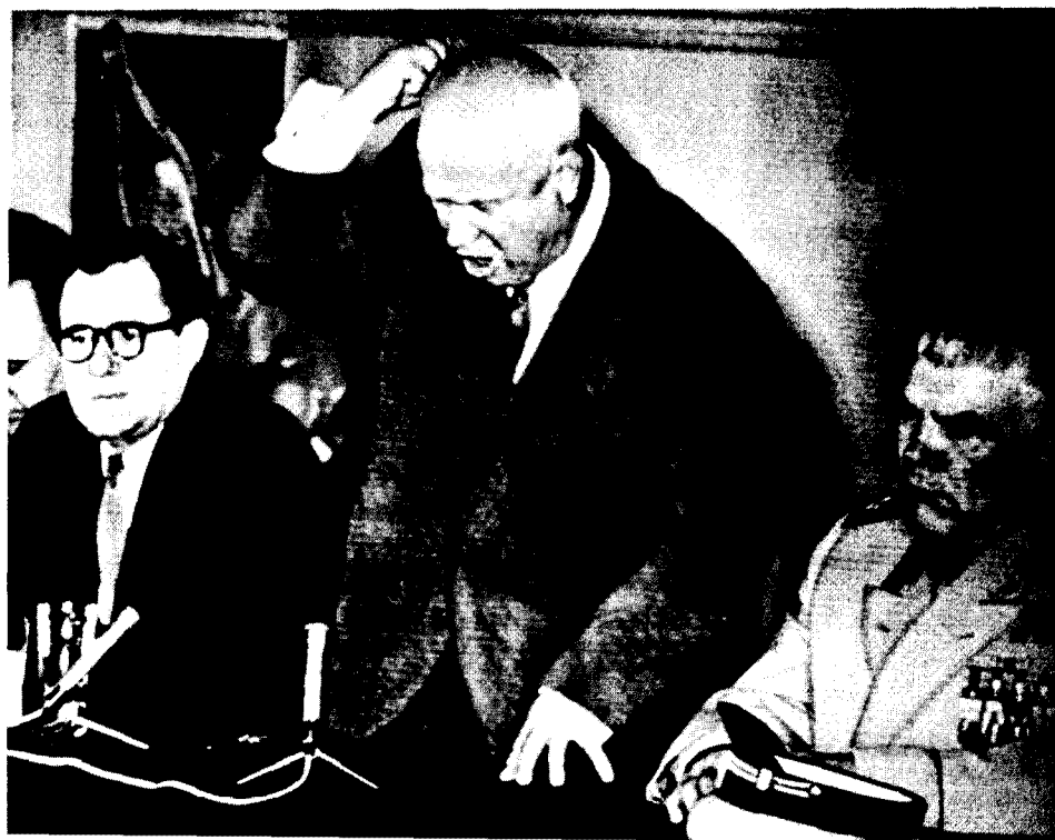
SLAMBANG SPEECH—Nikita Khrushchev pulled out all the stops at his press conference in Paris. Flanking the Red boss as he aimed his verbal bombs at the microphone were Russian foreign minister Andrei Gromyko, left, and defense minister Marshal Rodion Malenovsky.