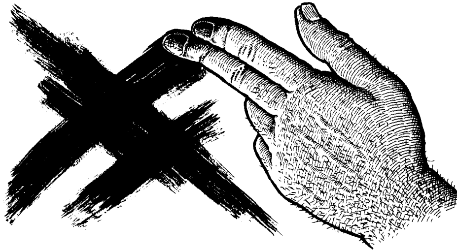
The Israelites smeared lamb's blood on the doorposts of their homes.

"This will be known from now on, therefore, as the Passover. It will show my mercy toward the people I have chosen to help carry out my plan on Earth. It will prove to Egypt that no heathen king, prince, idol or so-called god has any power against me.