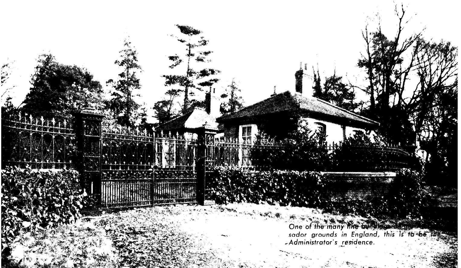
One of the many fine buildings on Ambassador grounds in England, this is to be the Administrator's residence.