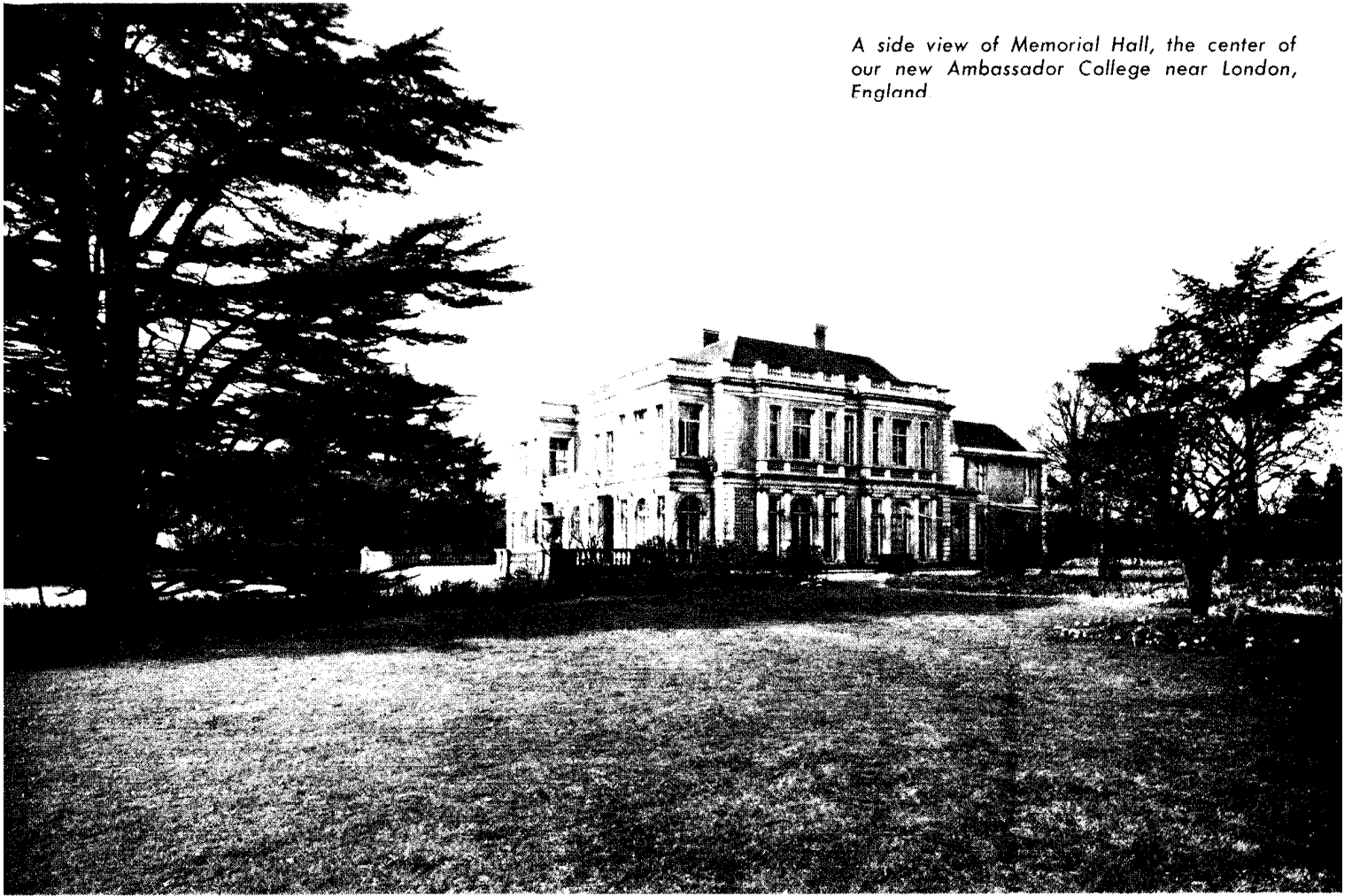
A side view of Memorial Hall, the center of our new Ambassador College near London, England.