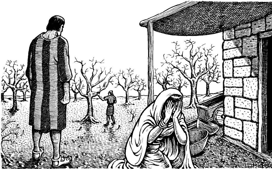
The Egyptians found that the locusts had eaten every green leaf and plant.