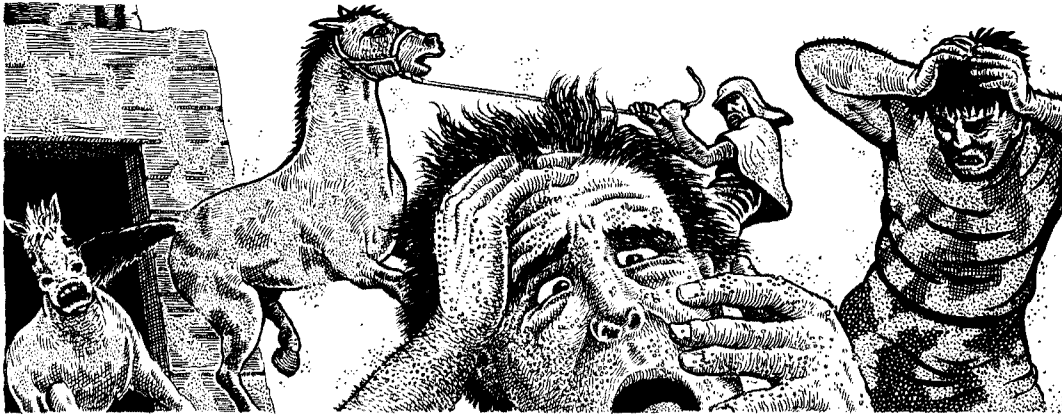
People and animals moaned in agony as their bodies became matted with the stinging insects.

Perhaps the magicians had performed their former amazing tricks through clever, natural means. Perhaps they had been helped by evil spirits. Or possibly there was a combination of both. Whatever the means, it didn't seem to be with them as they stood in fearful embarrassment before the king. The head magician suddenly bowed low, and it was plain that he was trembling.