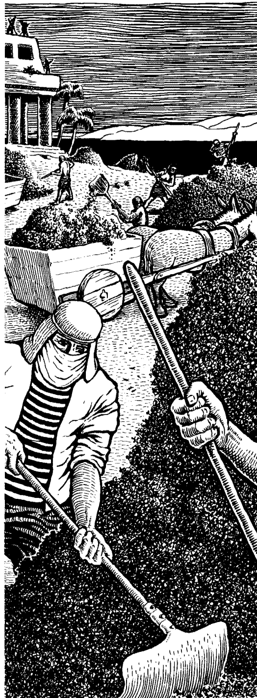
The Egyptians were still working hard to clean up the heaps of dead frogs when Moses warned of a Third Plague to come.

“Do something!” he commanded. “Prove again that our gods can produce miracles!”