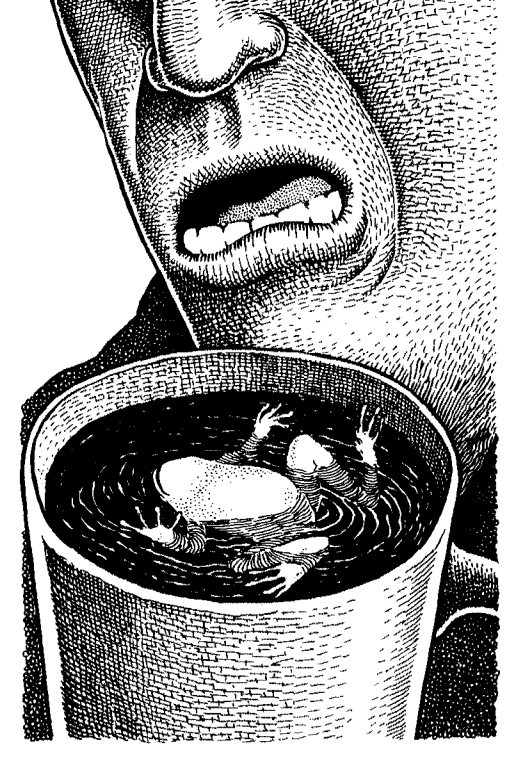
Another frog was floating lifelessly on its back in a silver cup of Pharaoh's favorite beverage.

"This Moses and Aaron," spoke up another named Jambres, "are not truly skilled