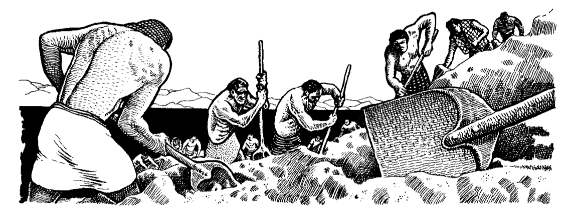
The Egyptians feverishly dug into the river banks in search of springs of clear water.

In spite of all the misery in the land, Pharaoh stubbornly refused to change his mind about the Israelites. However, as the week went on, he began to wonder if the discomfort of his people was too high a price to pay to keep the Israelites as slaves. At the same time Pharaoh and those about him were not as miserable as most other people, because every effort was made to supply clear water to the royal family. But Pharaoh knew that the nation couldn't last long under those conditions. He realized that sooner or later he would have to give in and call for Moses and Aaron.