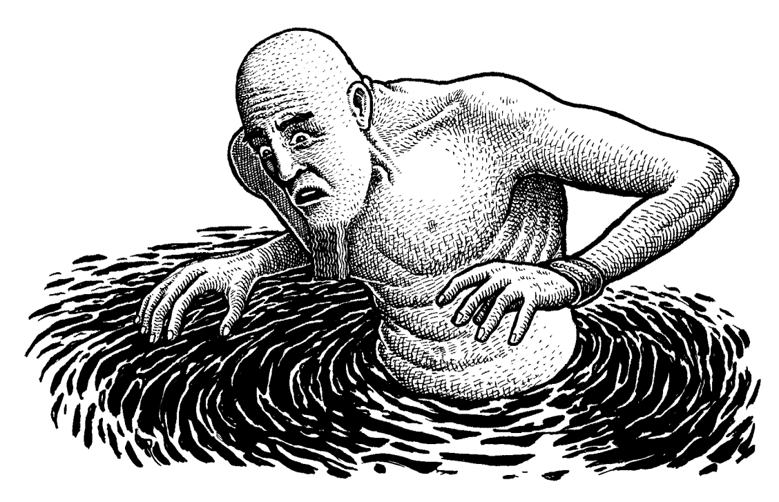
The King stared down at the water; it was turning red!

It was difficult for Pharaoh to regain his dignity and calmness. But he knew he must do so before his servants. Furthermore, he felt that he had to prove that the two Israelites