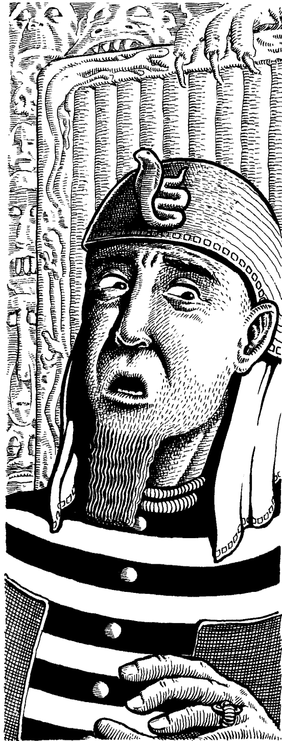
Pharaoh's bearded chin dropped at sight of the thing on the floor.

"I don't think," he told them, "that your God can do any more than our gods can do."