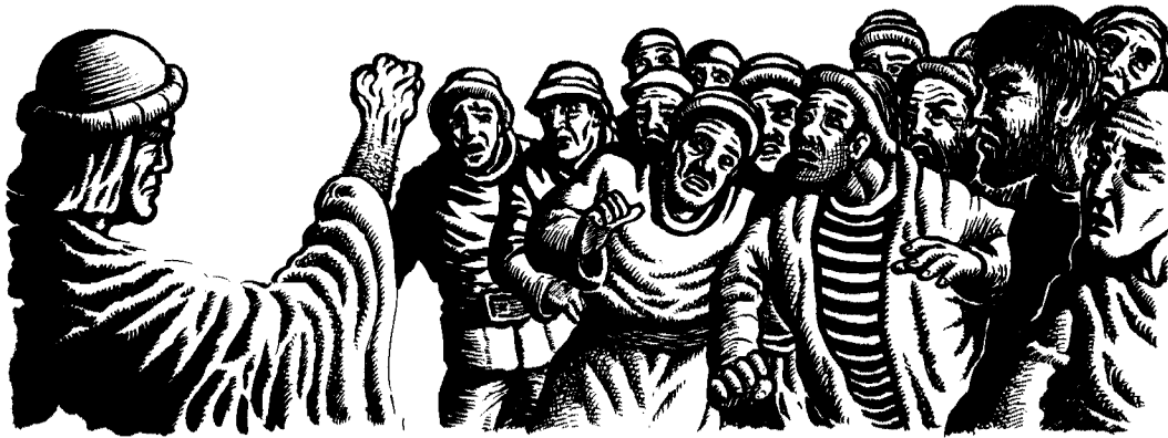
Moses held up his hand for the elders to see that it was only a white, decayed stub.

Now there was silence as Moses held up his right hand for all to see. He put it inside his jacket for a few seconds, then withdrew it to show a white, leprous, decayed hand that brought a chorus of cries of horror from the crowd. A moment later, when