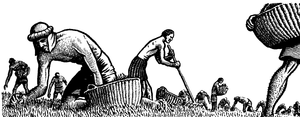
Israelite brickmakers were forced into working longer hours because of having to glean straw from the harvested grainfields.

Instead, the officers sent men to Pharaoh to complain about matters. When these men came before the Egyptian king, they told him that it was impossible for the Israelites to do all the work that was expected of them, and that the Egyptians were very unfair to expect so much work to be done.