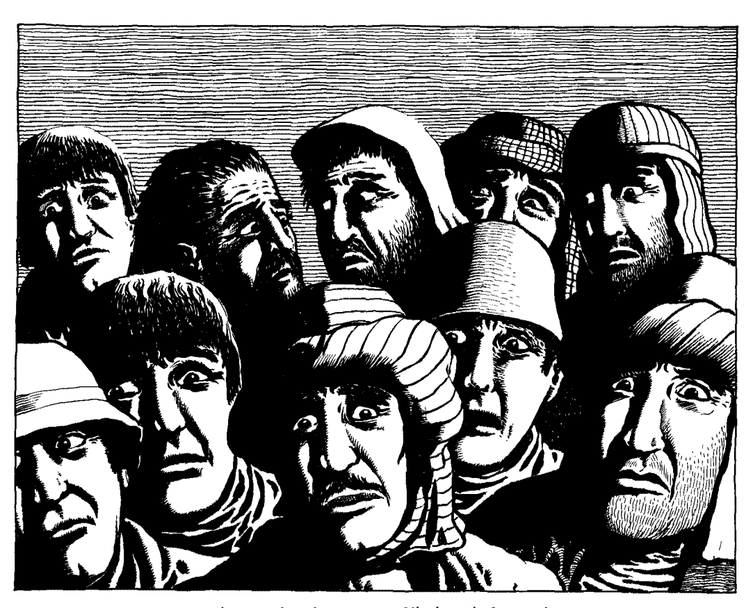
Joseph's ten brothers were filled with fear when they were told that they would be jailed.

"But we are telling the truth!" they called to Joseph as guards roughly led them away to a dungeon. (Verse 17.)