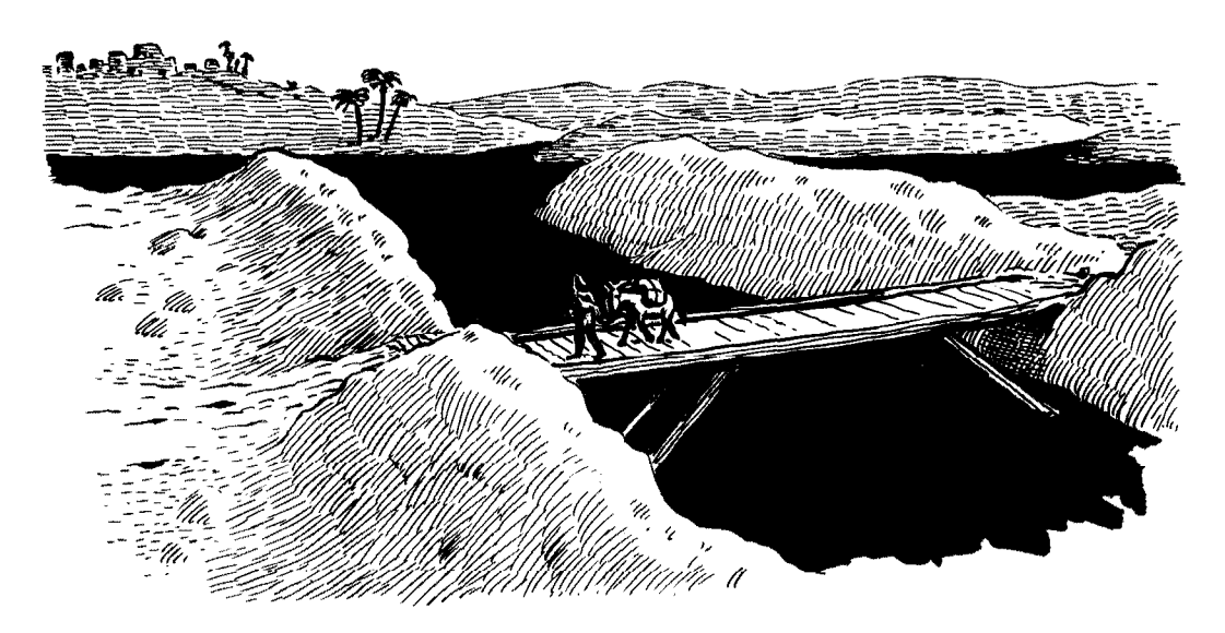
Under Joseph's direction, the Egyptians dug giant ditches to convey water to arid regions.

that land would never have amounted to very much. But during those seven years of plenty, there was much more rain than usual, so that areas far from the Nile gave most unusual crops.