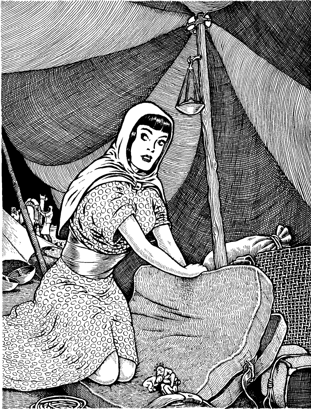
Rachel went to her tent and hid her father's little idols under a camel saddle.

tomorrow morning we'll overtake them. Then Jacob will learn that he was most unwise to leave as he did!"