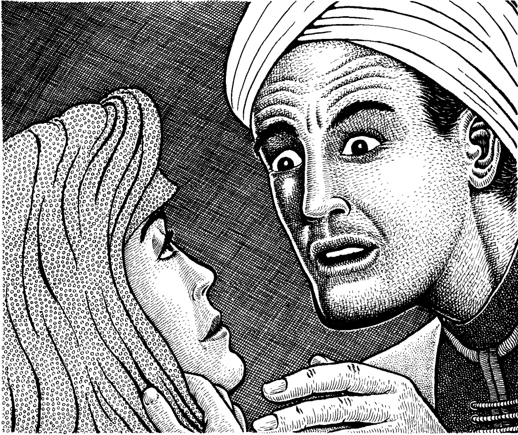
The bride drew back her heavy veil, and Jacob was amazed to see that he had married Leah—not Rachel!

When the seven years had passed, Jacob reminded Laban that it was time for the marriage. Laban gave a great marriage feast that lasted a whole week. Many people were invited, and it was a time of much celebration.