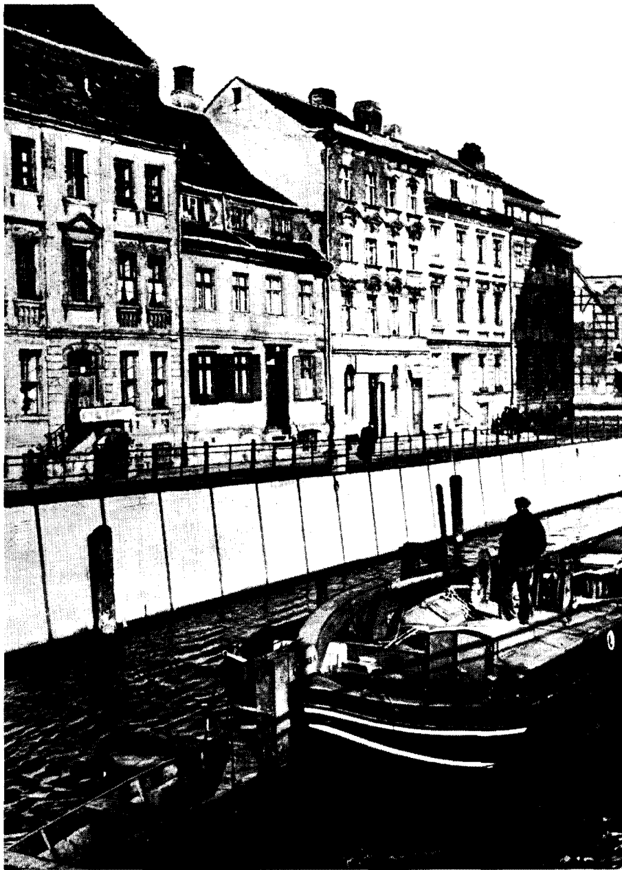
Amid political rumblings, East-Berliners remain quiet, go about their daily chores, and hope for the day when their land can once again be joined to a powerful, revitalized New Germany!