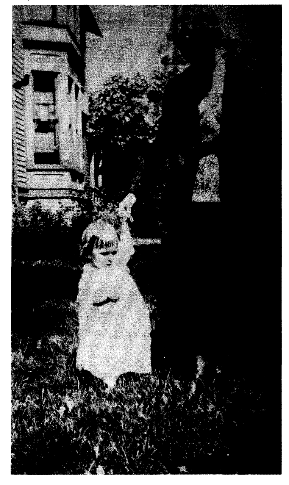
May, 1919—at one year, learning to walk, at Second Street house in Maywood, Illinois.