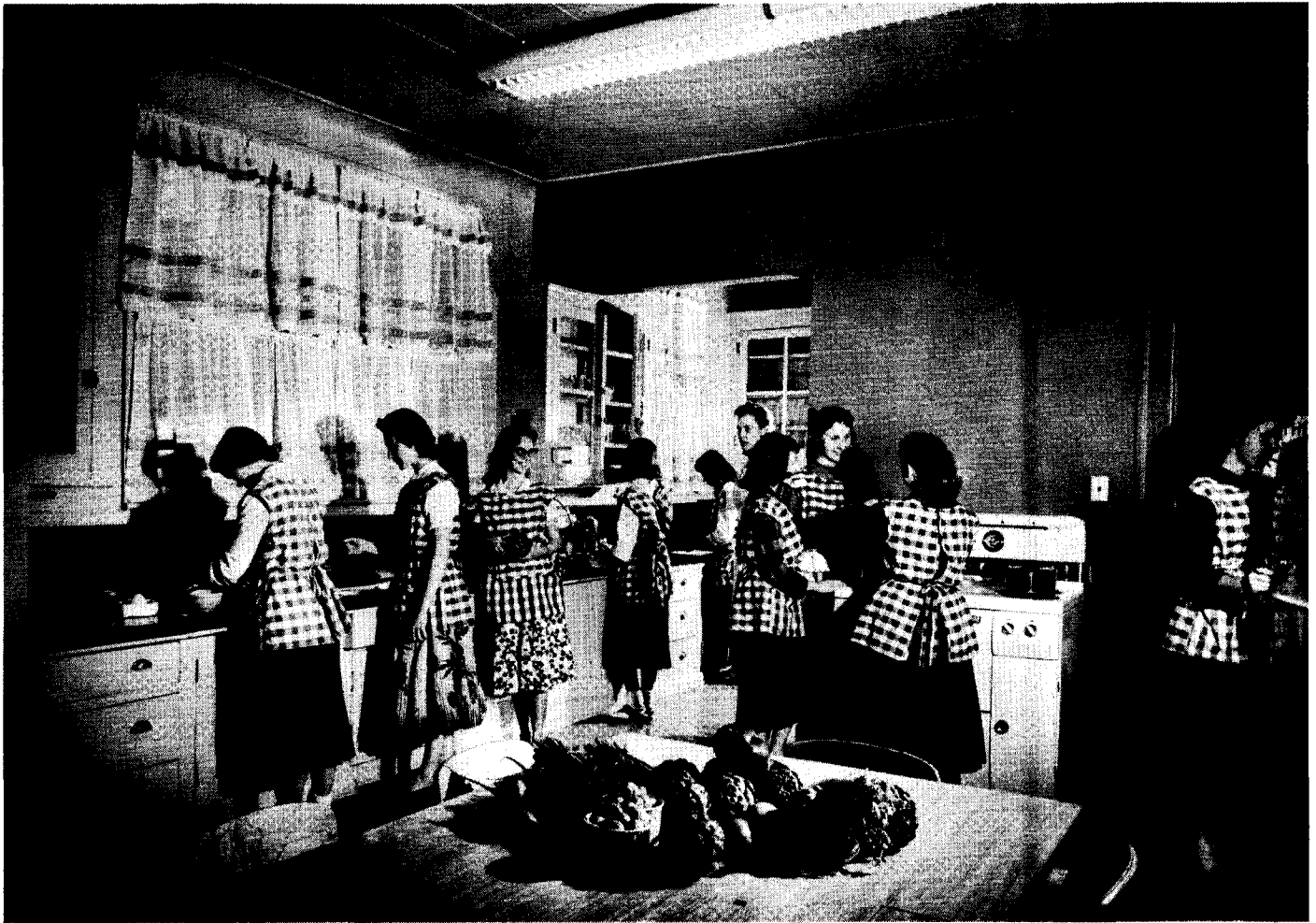
HOME ECONOMICS Department. Young women at Ambassador have splendid opportunity to learn and to apply principles of healthful living.

PERSONALITY—the whole being—as a sharp and effective instrument in the hands of Almighty God the supreme RULER of heaven and earth.