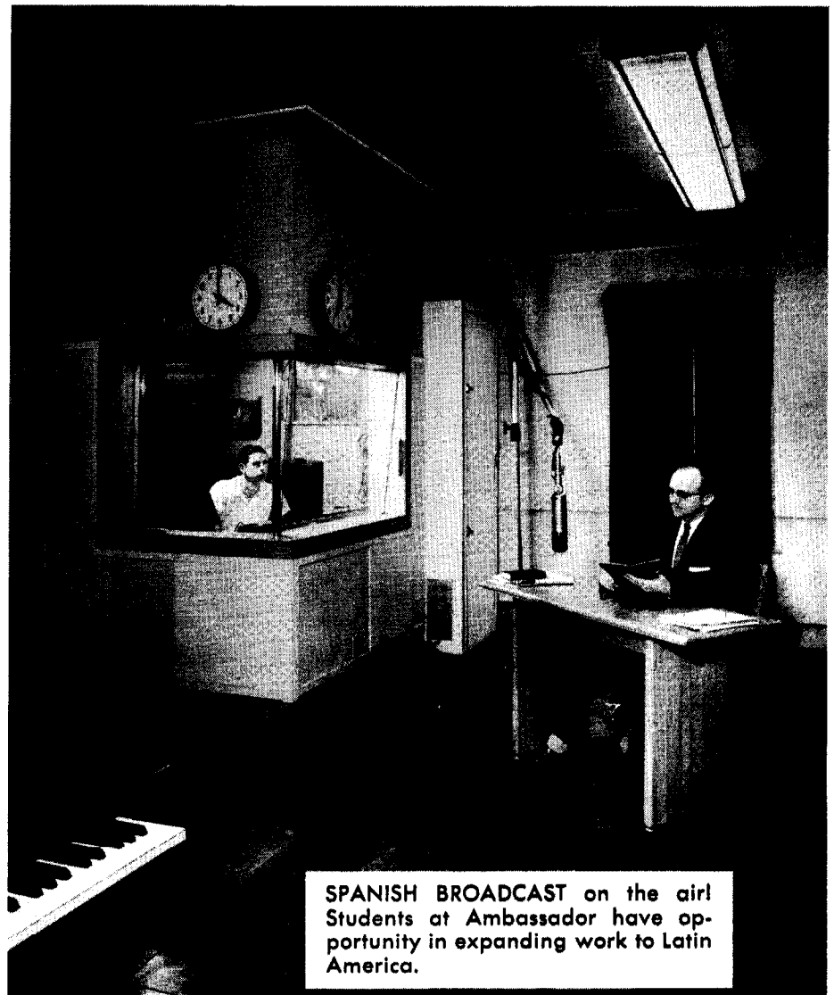
SPANISH BROADCAST on the air! Students at Ambassador have opportunity in expanding work to Latin America.

Perhaps the most important educational advantage at Ambassador is that students are taught the real PURPOSE of human life . This enables them to properly orient themselves in any other subject they may ever study—and to prop-