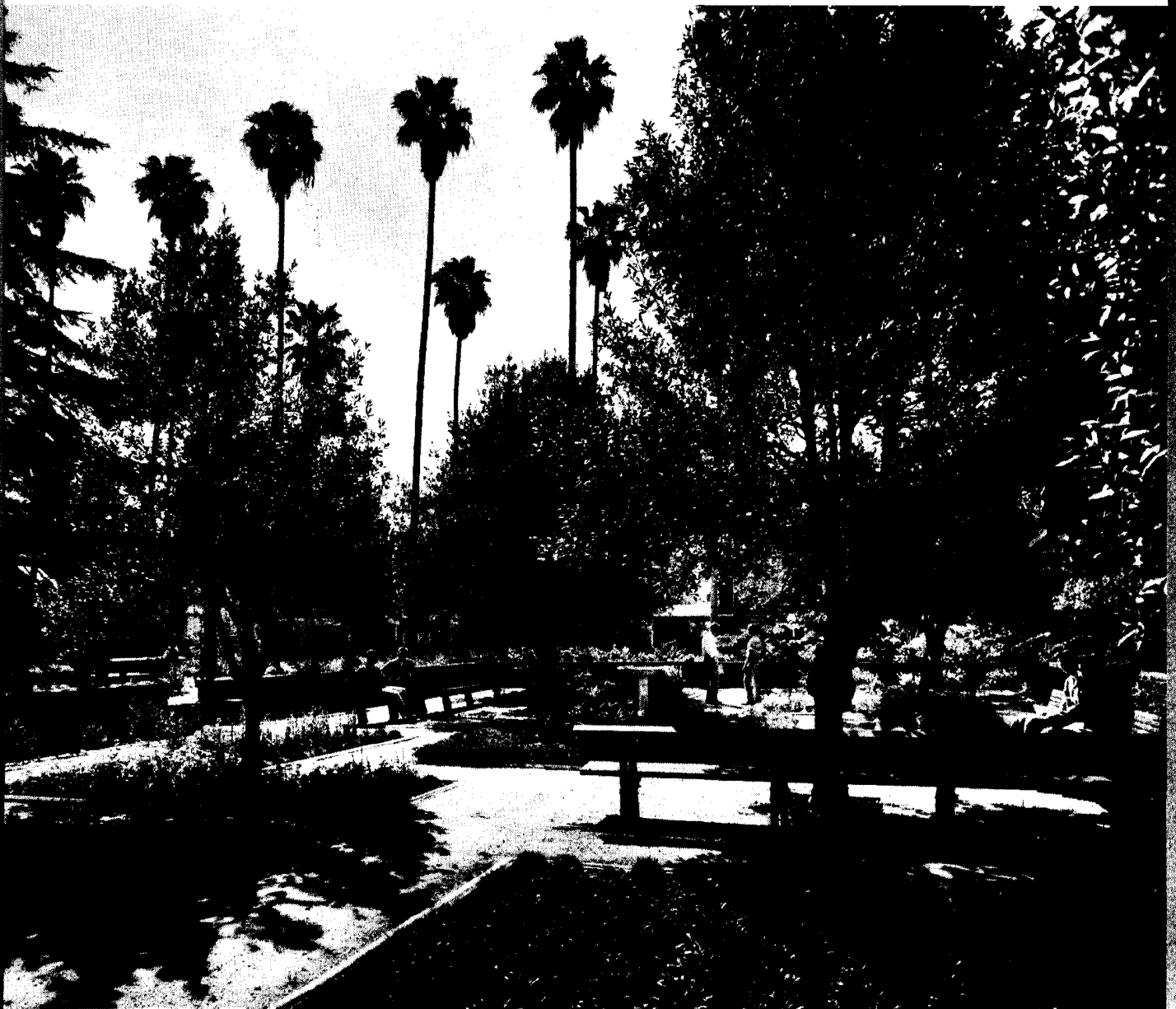
SPACIOUS SUNKEN GARDENS surrounding Manor del Mar, men's student residence. In sunshine of Southern California, students find outside study pleasant and relaxation a delight at Ambassador College.