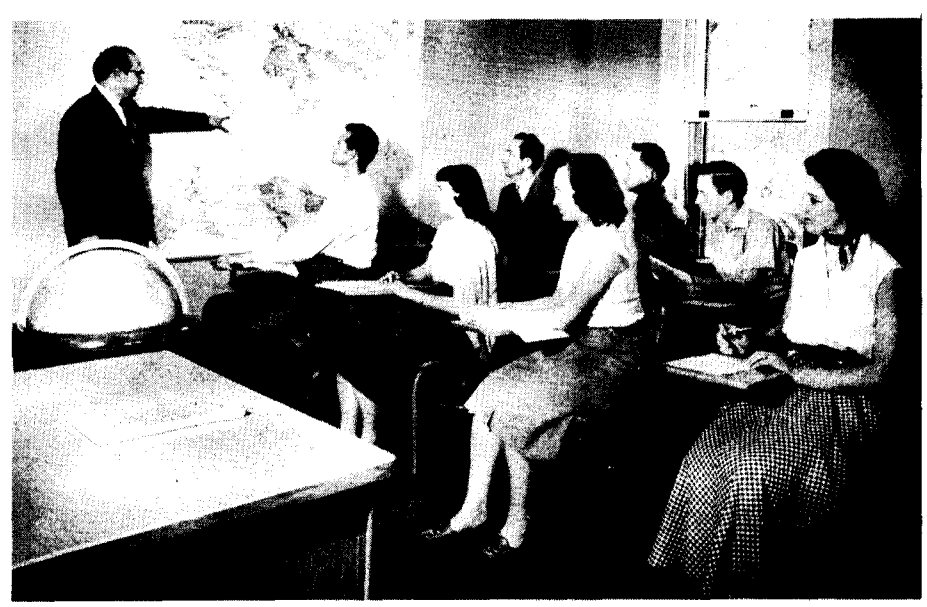
An Ambassador College class in session—reflecting the excellent faculty-student ratio which facilitates personalized instruction.

But there is one college which is awake to the evils of this world's education. It has set out to correct these errors by imparting the knowledge of the purposes of human existence—by objec-