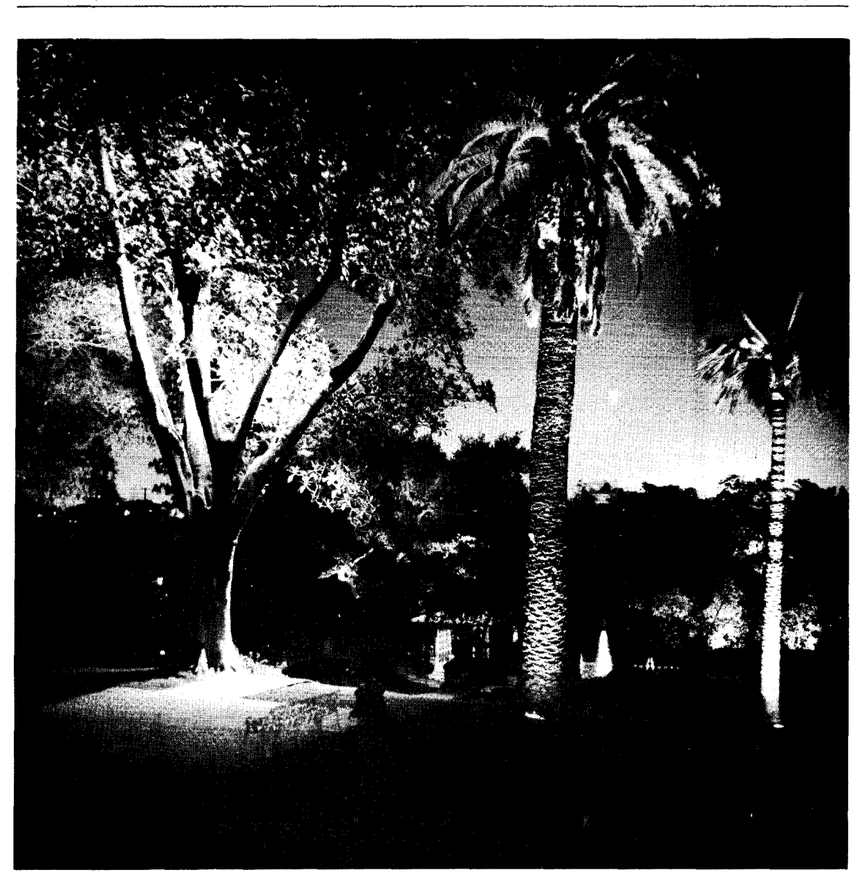
Night lighting creates this enchanting view of AMBASSADOR COLLEGE campus