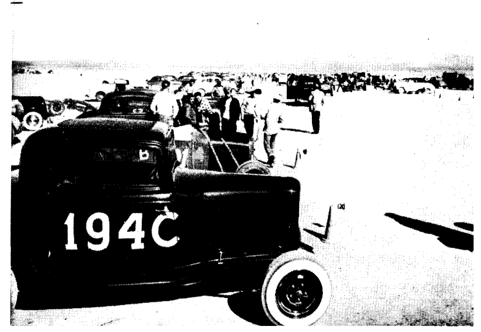
Typical entertainment for youth—a hot rod race. Here you see the cars and drivers line up while waiting their turn.

Because parents do not want their children punished, and because of modern psychology being applied in the idea of "progressive education," the laws governing our school systems FORBID THE PHYSICAL PUNISHING OF A CHILD in many states, giving the children a feeling of protection in their uncooperative attitudes. Teachers report that situations depicted by articles and by the movie called "Blackboard Jungle" are NOT rare, isolated occurrences which