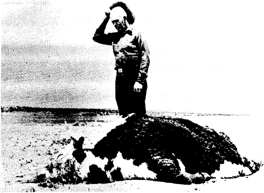
Cattle die in the worst drought to hit the Southwest in 50 years.