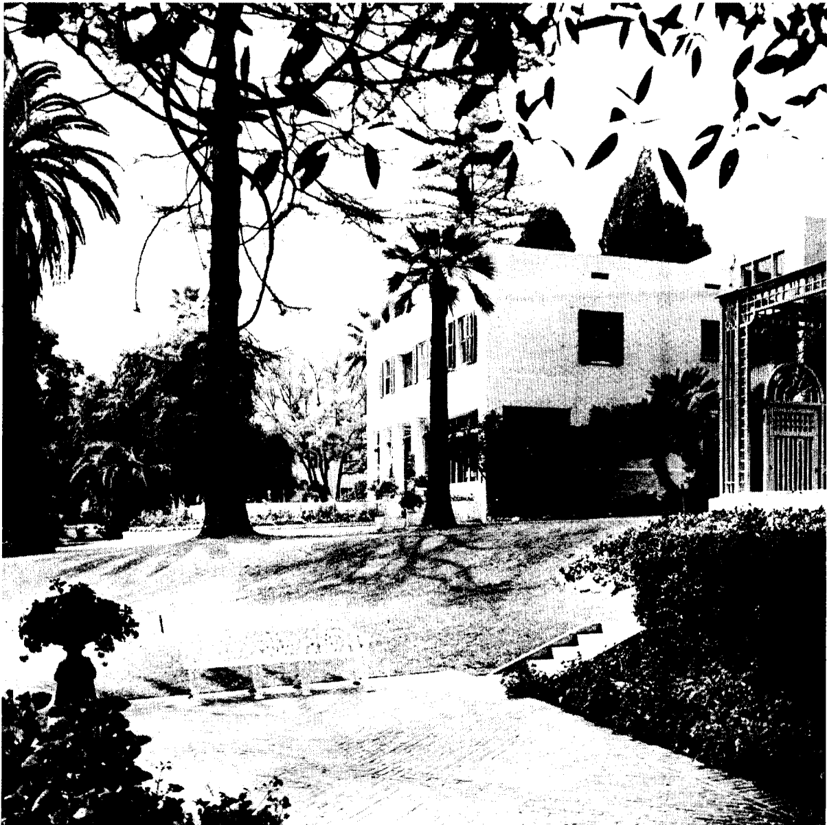
One of four patios on our picturesque AMBASSADOR COLLEGE campus