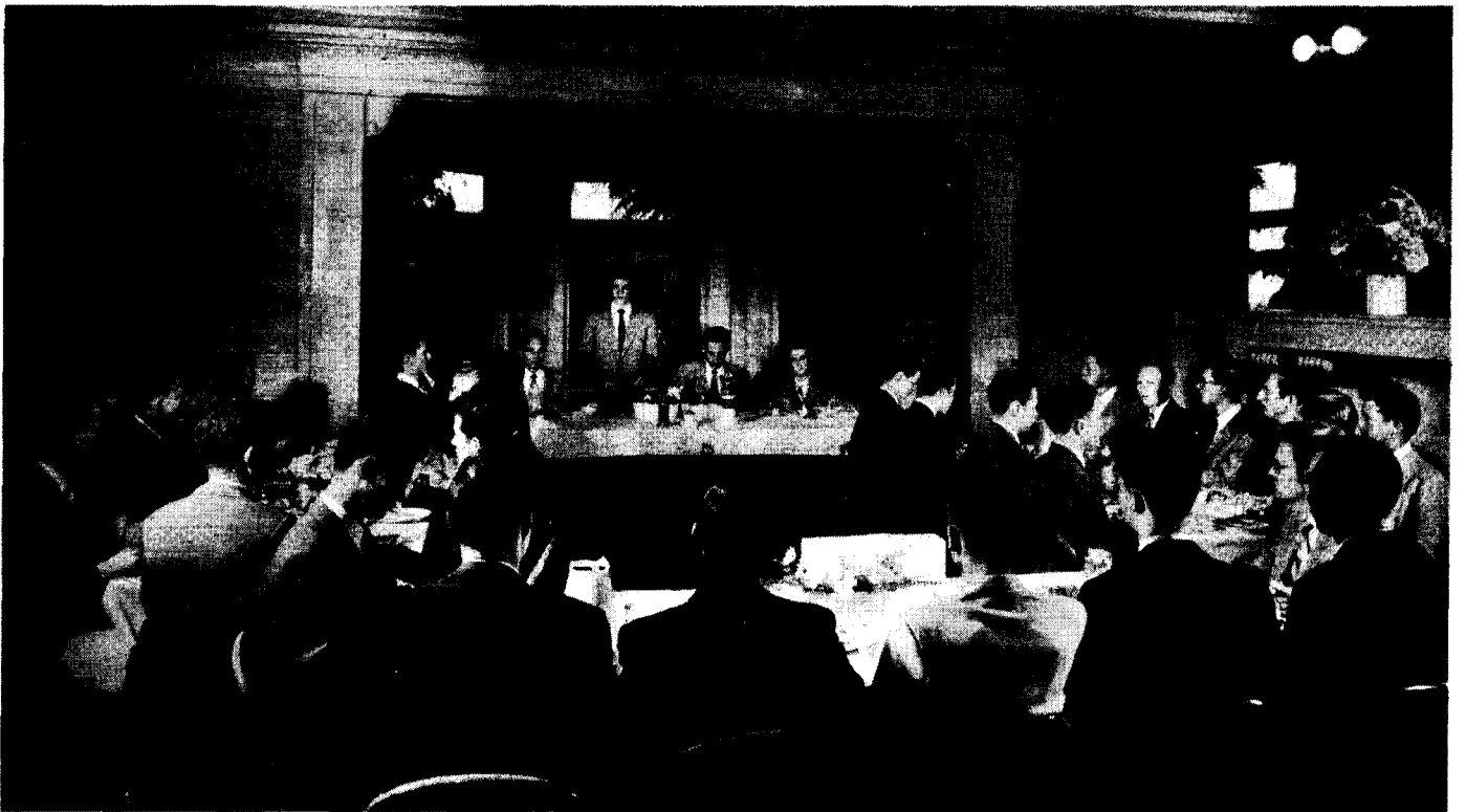
"The Ambassador Club," men's after-dinner speech club, trains men for public speaking; meets every Monday evening.