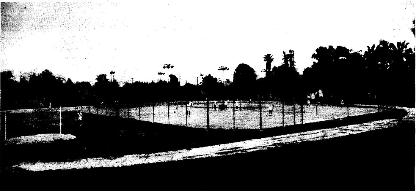
Ambassador College Athletic Field. 42,000-watt flood lights illuminate new modern tennis courts for night play.