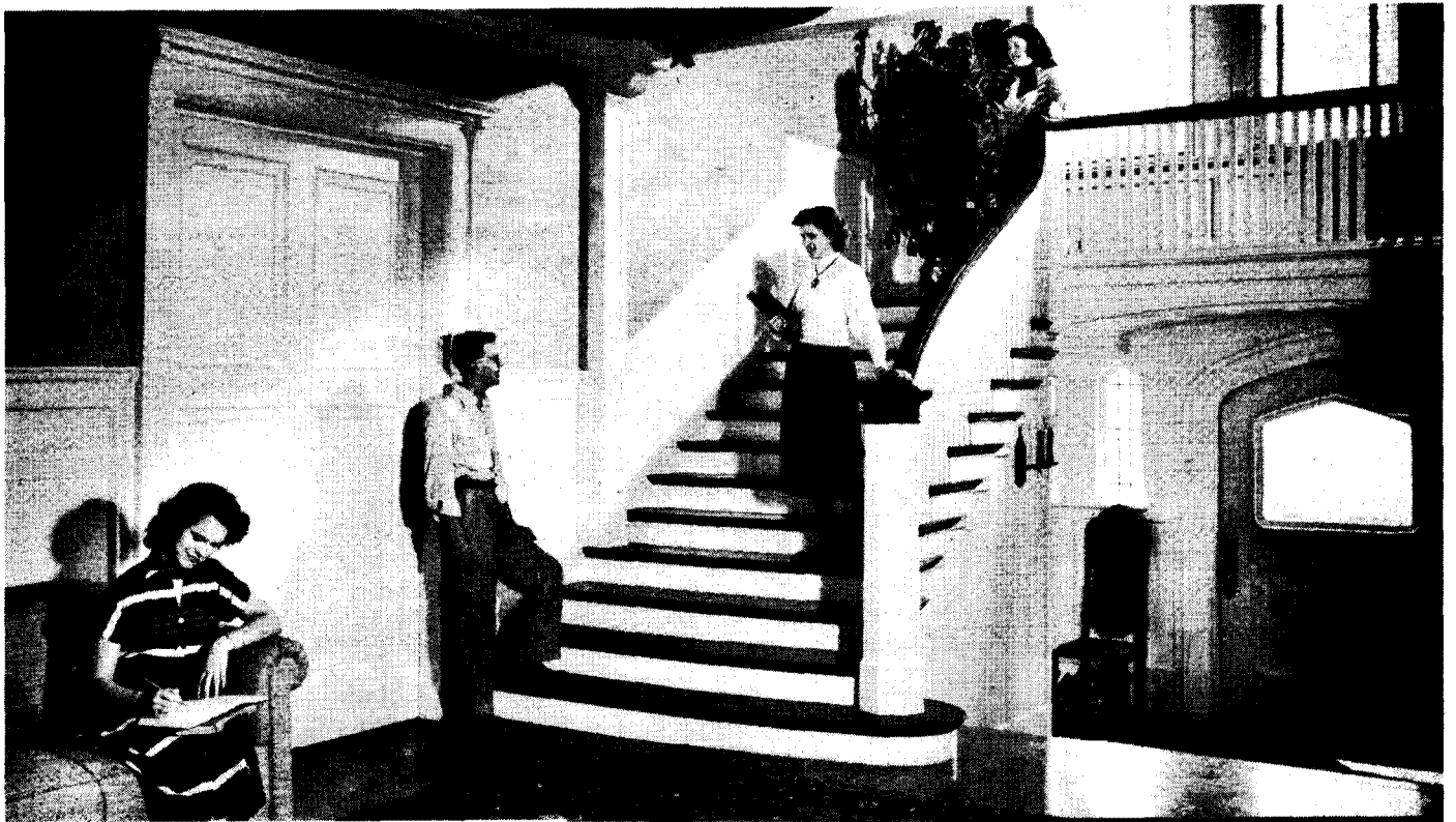
torial offices of The Plain Truth are in basement. Upper left, Mayfair mostly secluded by trees. Upper right, great hall, and girls' stairway to second floor. Lower left, the beautifully contoured, spacious Mayfair grounds, college classroom building in distance. Right and below, two of the delightful girls' rooms on second floor.