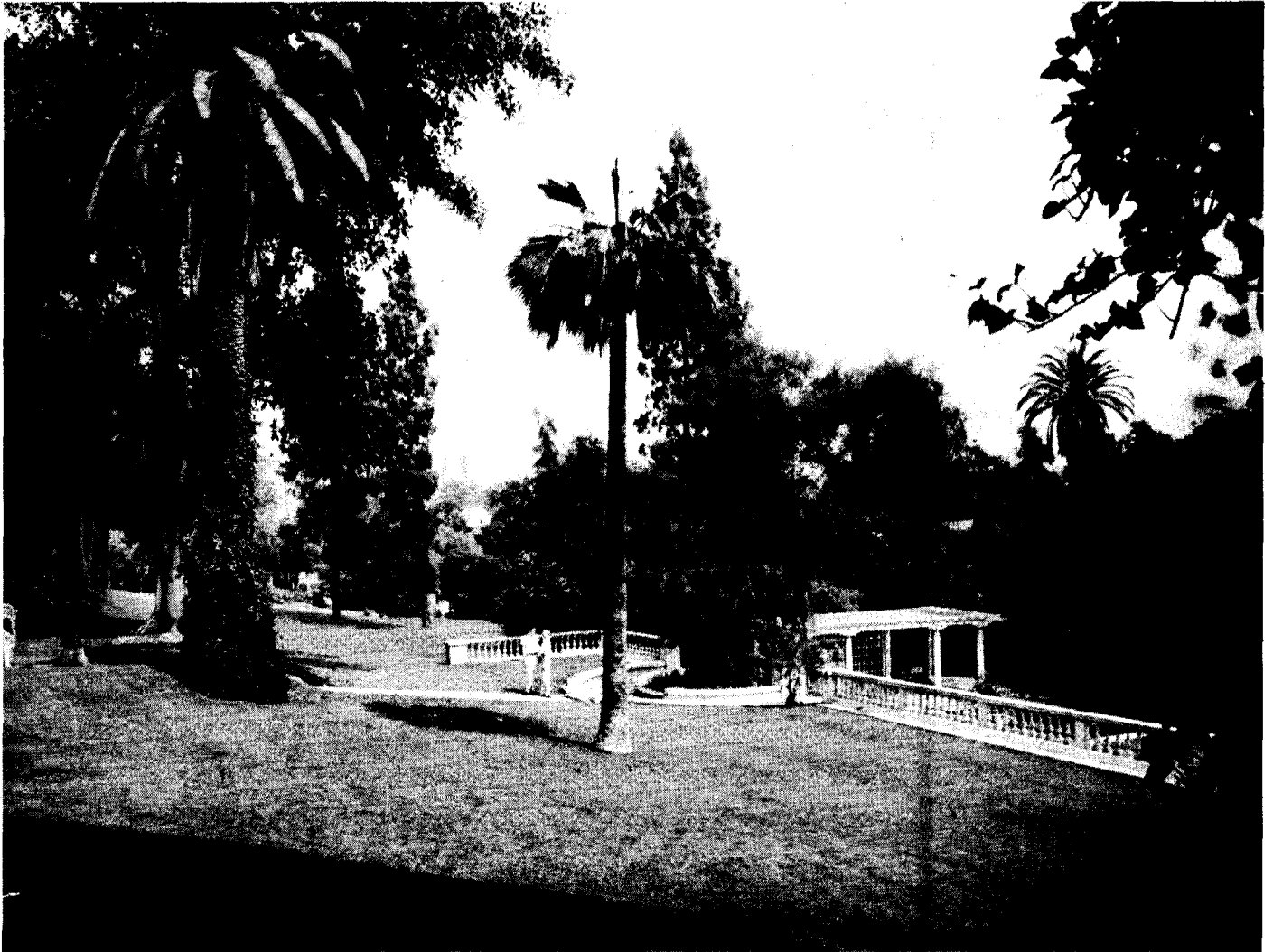
Magnificently landscaped campus grounds of Ambassador College are expansive, restful, beautiful.