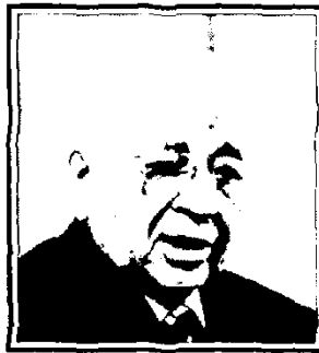
HERBERT W. ARMSTRONG

What brought a fast-advancing civilization to the very brink of such unbelievable—yet real ultimate catastrophe? Why the paradox? If the threat is too awesome for most to contemplate, so is the advancement and progress in