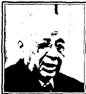
HERBERT W. ARMSTRONG

If ever a President needed the help of this great people he leads, it is now. Some are asking, can you turn the United States around? They look to problems of inflation, unemployment, energy, taxes, budget, business, defense. But those are materialistic problems. In the materialistic area we have fared better than we realize. This nation has