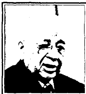
HERBERT W. ARMSTRONG

Yet we all try to simply put that awesome possibility out of mind! Do we suppose that just not thinking about it,