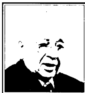
HERBERT W. ARMSTRONG