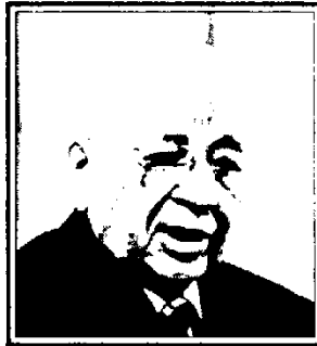
HERBERT W. ARMSTRONG

They know nothing of the overall PURPOSE being worked out here below! Consequently they guide humanity in a course in conflict with that purpose! Lacking knowledge of THE WAY to peace, we have no peace. Leaders talk of peace, they profess to work for peace, they fight for peace, while they give approval