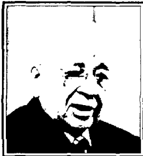
HERBERT W. ARMSTRONG

not look deeply enough to see. There are, basically, only the two broad ways of life. They travel in opposite directions. I state them very simply. The one is LOVE, meaning outflowing concern for the good of others, cooperation, serving, sharing. I term it "GIVE." The opposite way to which this world is drawn is "GET."