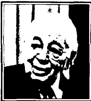
HERBERT W. ARMSTRONG

It is a political onslaught to determine once and for all that the CHURCH of the living God may be governed by Him according as He directs through His chosen apostle, as revealed in His Word, the Holy Bible!