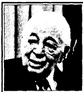
1980, writing in the Washington Star, described it this way:

Pogrom, however, may be the only word suitable for describing the ghastly attack on our Church by the attorney general. Conservative columnist James J. Kilpatrick, on March 25,