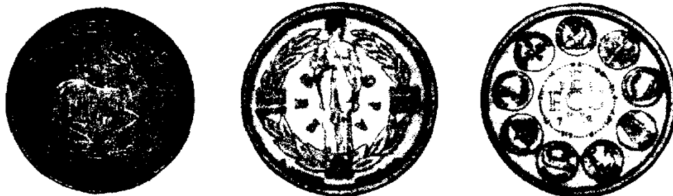
The Krugerrand (left) and the ECU

"Highly important, but little publicised was the announcement recently that the European Economic Community (EEC) would issue a gold coin, the ECU (pronounced Eh-Cue), marking the first coined money of the European Monetary System and the EEC.