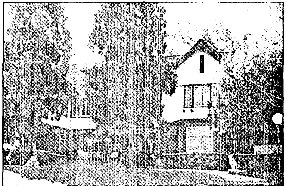
The church owns at least 150 residences such as this in area around the campus.

parcels of prime residential property in the Orange Grove Avenue area surrounding the 40-acre Ambassador College campus. Average value of homes in the elegant turn-of-the-century neighborhood is $150,000.