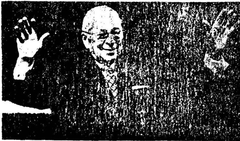
SENIOR ARMSTRONG RETURNS — — Herbert Armstrong, head of the worldwide Church of God and father of Garner Ted Armstrong, airwave evangelist, made a vigorous appearance to deny reports of disunity in the church he built and to outline its future plans. In the above picture, Armstrong gestures his thanks for applause while in the lower shot, he gestures, as if to emphasize his position of dominance.