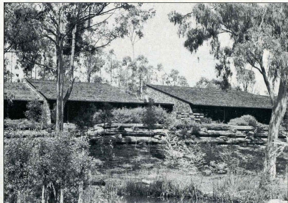
Specially designed to fill the needs of the Work, this 14,000-square-foot office building in Burleigh Heads, Australia, was completed in 1976 and now houses the regional headquarters.

Once the office was established, the Church began to