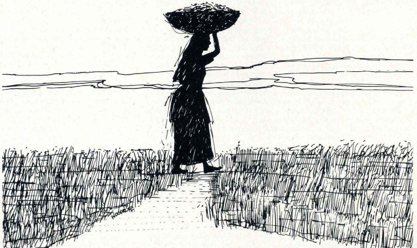
Illustration by Mike Woodruff