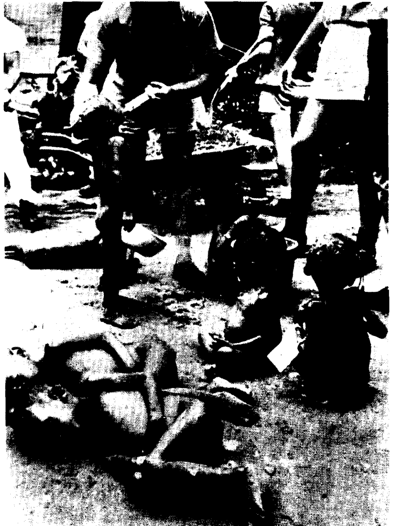
Top: Wide World Photo; Above: Picture Parade Photo