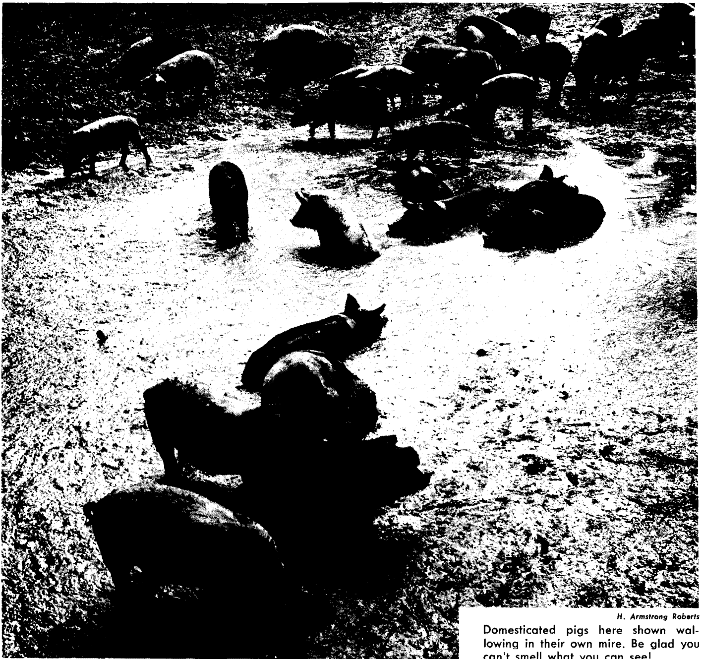
H. Armstrong Roberts

Domesticated pigs here shown wallowing in their own mire. Be glad you can't smell what you can see!