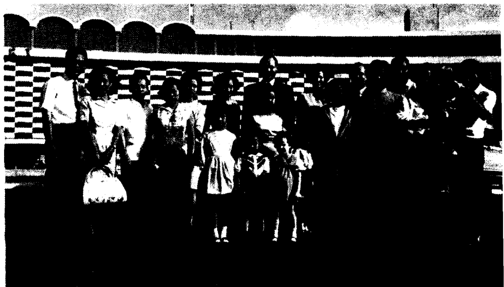
Ambassador College Photo