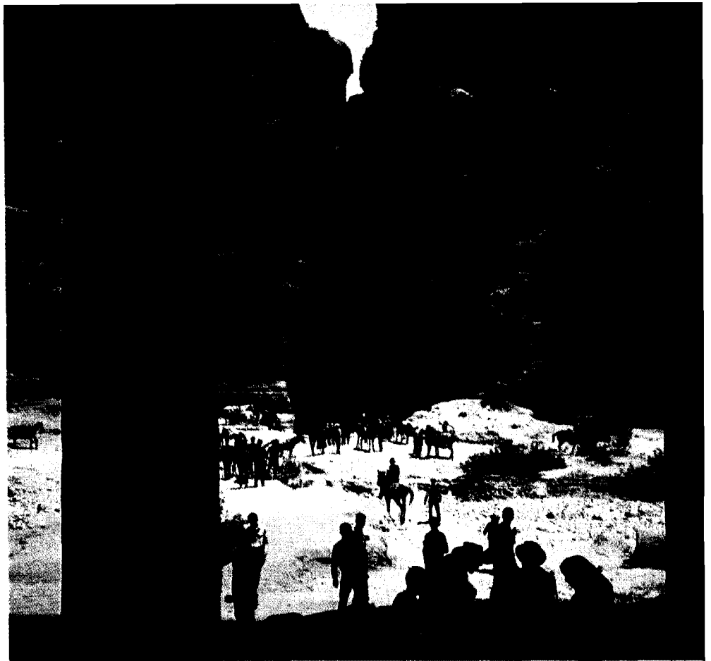
Tourists seek shelter from the sun in the "Treasury" cave, while others mill around in the sun at the Siq entrance.