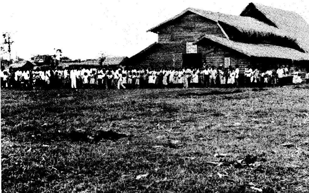
First Philippine Feast of Tabernacles at Kiara, Mindanao.

The natural ability of the Filipino people to follow will be used by God to great advantage in the Church today, and in His government in the World Tomorrow. The people will follow those in authority and are obedient to them once they are converted. For this reason God has chosen the Filipinos to be His people today in the Far East. He knows that they will submit to authority readily and obey that authority. They have been trained to submit to authority during 400 years of foreign rule. Unconverted, they will often stick