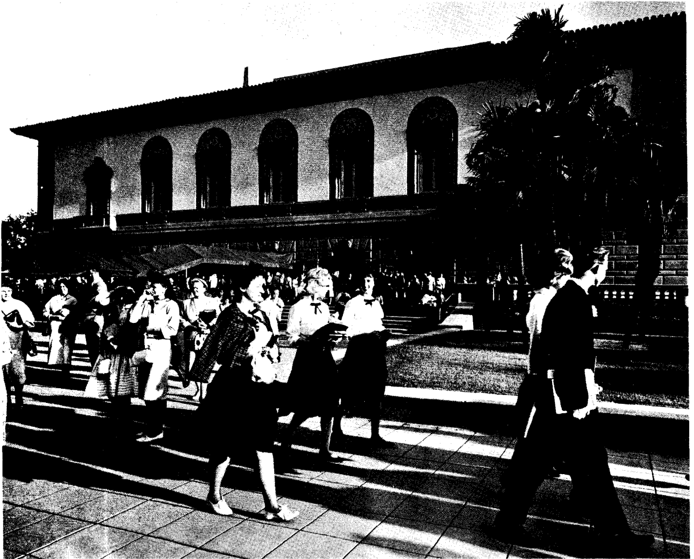
Outside view of the Civic Auditorium showing brethren and Ambassador students leaving one of the services.

brethren in attendance even on the weekly Sabbath to hear the sermons. Many had come in from Wisconsin, Minnesota, Iowa, Nebraska, Michigan, Indiana, Kentucky, and other outlying states to attend the entire Festival in Chicago.