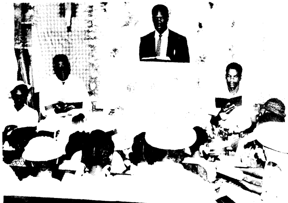
Notice the festive atmosphere in the Unleavened Bread service of our brethren in the West Indies.