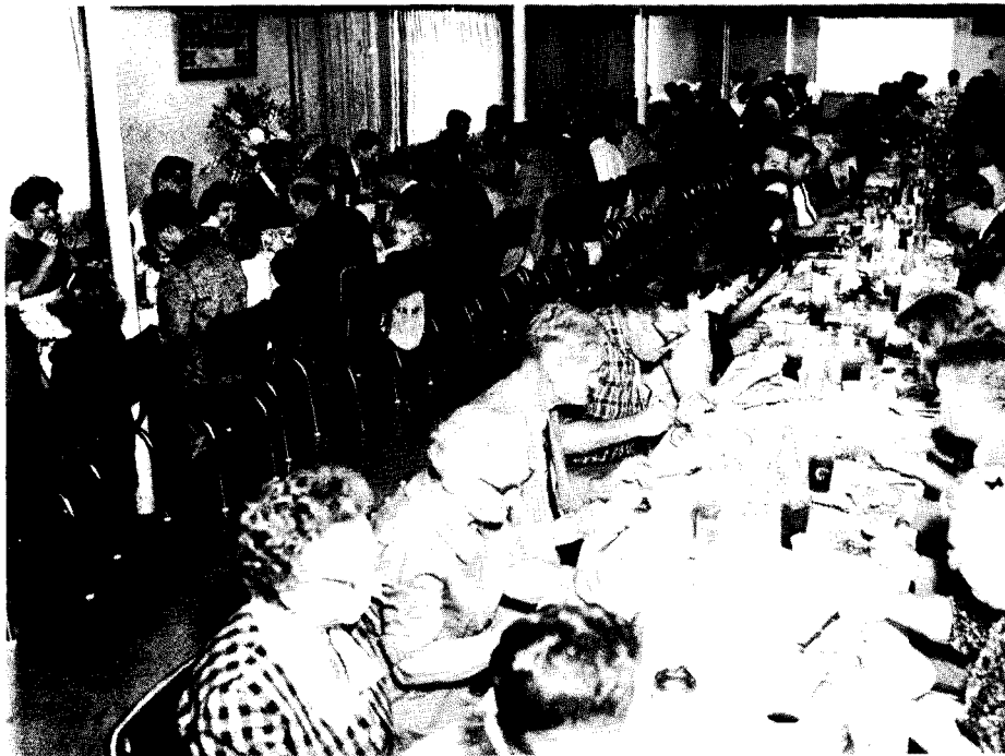
The brethren meeting in Opp enjoy one of their meals during the Feast.

"The National Guard Armory worked out splendidly. It was just like owning our own Tabernacle for the eight days. We had absolute privacy, use of the entire building, and were not disturbed by one intruder during the entire time. They say such is unusual in a commu-