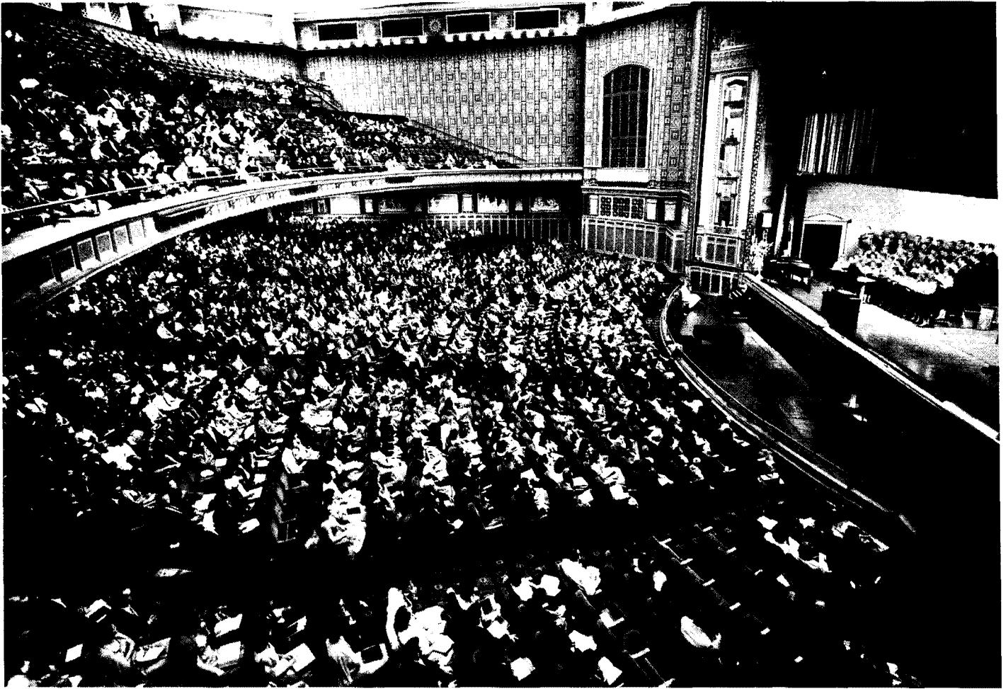
Over 2000 brethren assemble in beautiful Pasadena Civic Auditorium — with Ambassador Chorale on stage. This was on first Holy Day of the Feast of Unleavened Bread.