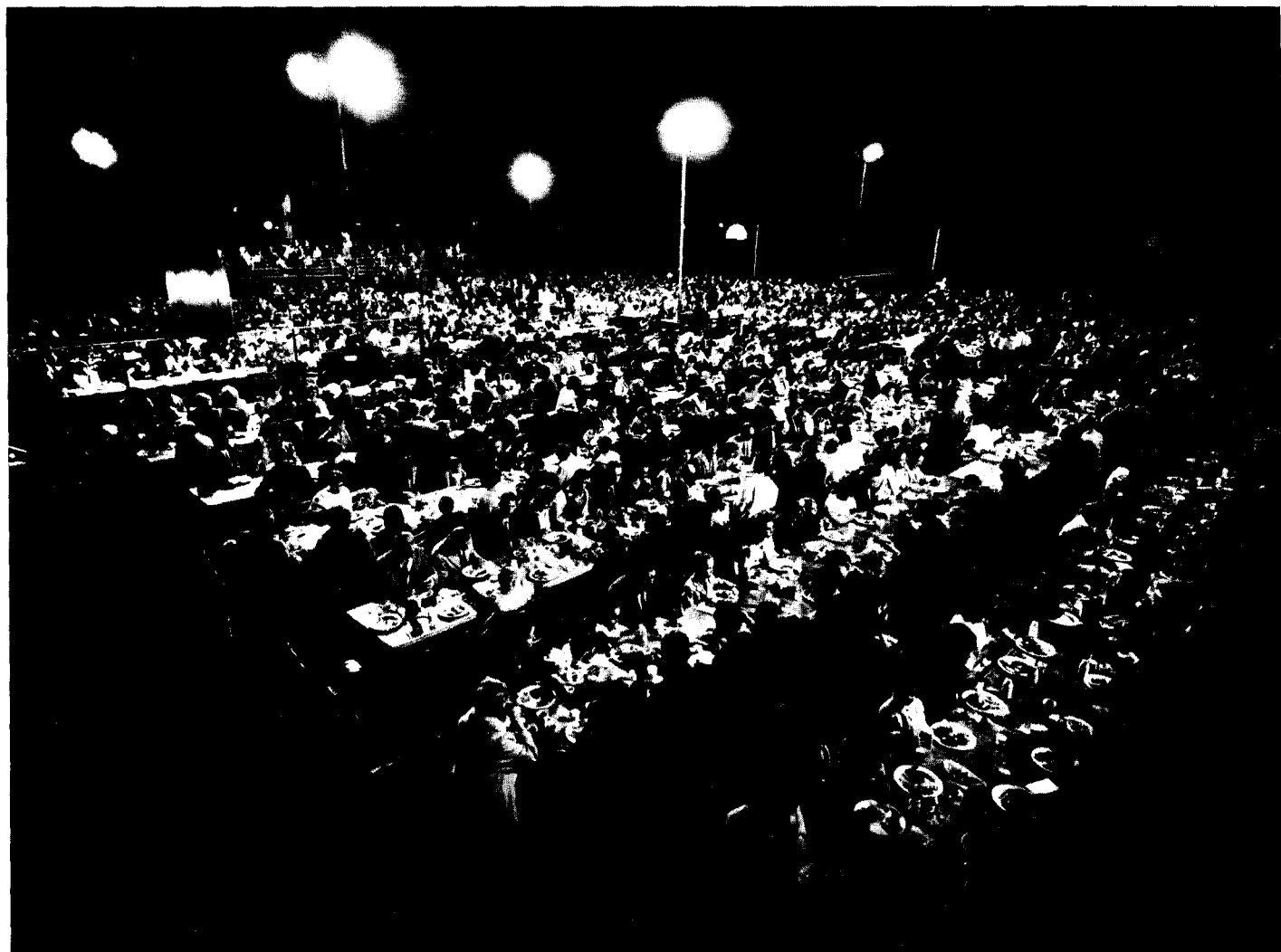
The delicious feast on the "Night to be Remembered" was enjoyed on the tennis courts of Ambassador College in Pasadena.

"We were blessed with splendid cooperation from all deacons, deaconesses,