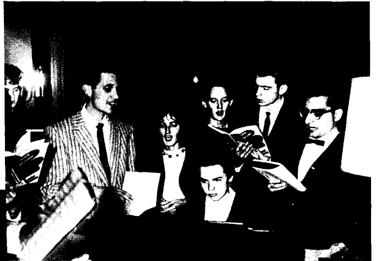
A time for singing—this spontaneous evening scene is representative of many a song session around the piano following a social occasion.