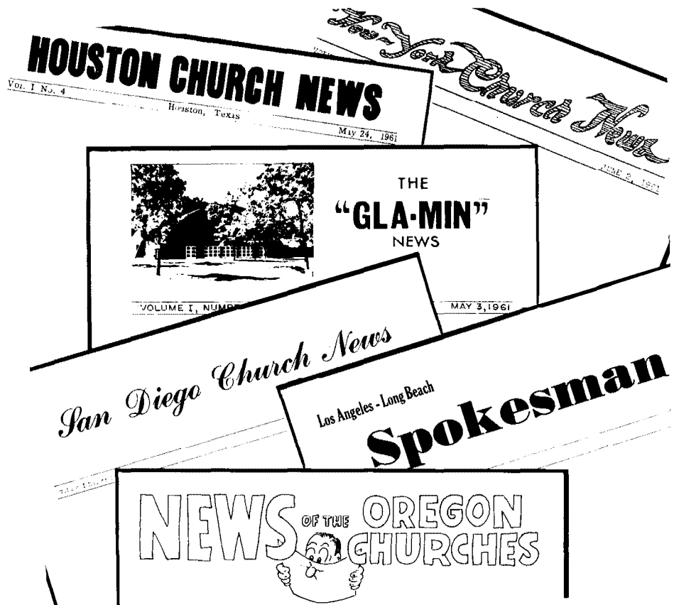
Mastheads of several of the local church papers.