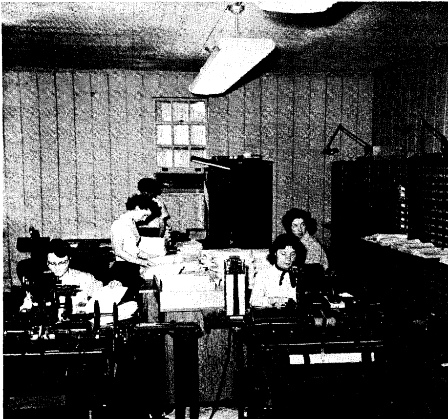
Ambassador College Press Mailing Department as it was in the years of 1948 through 1956.