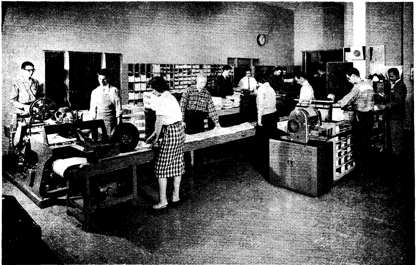
Ambassador College Press Mailing Department as it is today — 1961 — showing part of our new IBM electronic system.