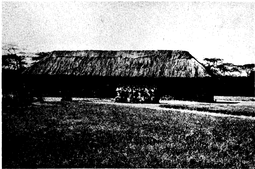
First week's service at Mwambula's Village, April 30, 1961.

"I have one man in the meetings — he is church elder in Dutch Reform Church. He stood and tell the people that 'I was preach the false doctrine to you people