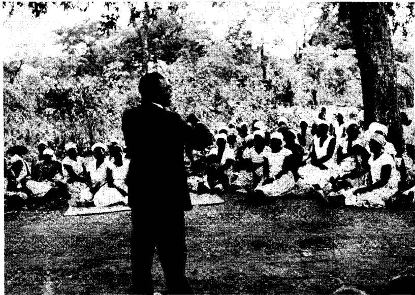
Service conducted at Kasenga's Village on May 7.