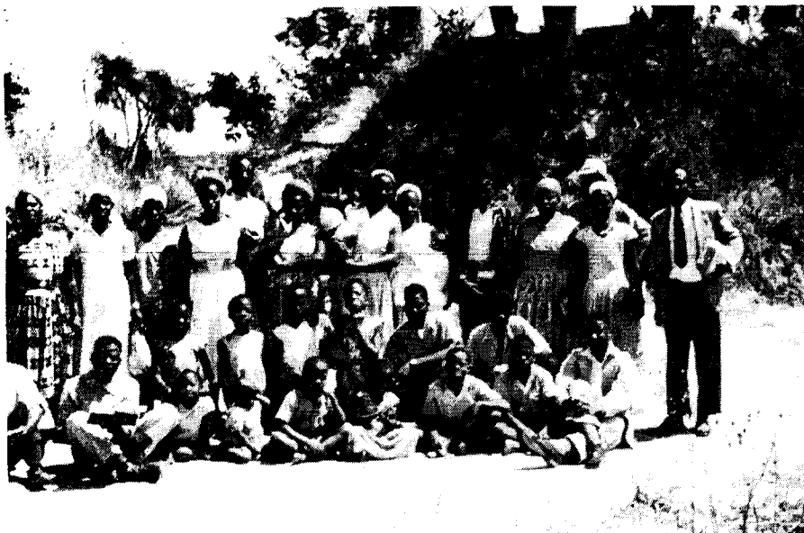
Left, the church members who attend the local congregation at Chimwemwe near Kitwe.

how you are going to attend the Feast of Tabernacles next year! Many hundreds did not attend who possibly COULD have. A staggering number who had attended the year before DID NOT attend this year!