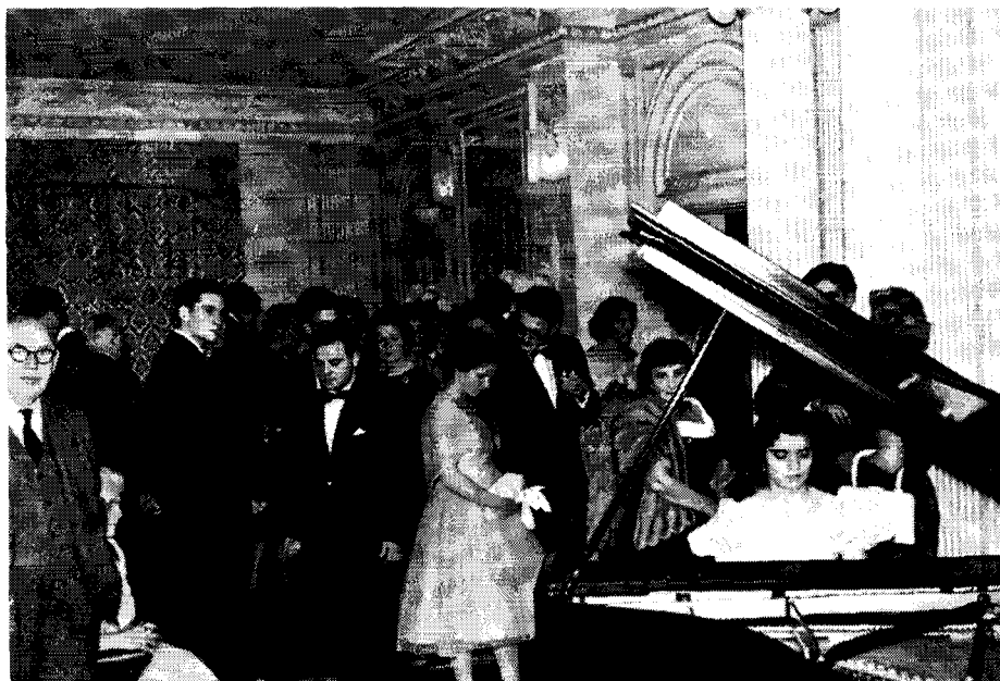
A candid view of the Faculty Reception at Ambassador in the United Kingdom.