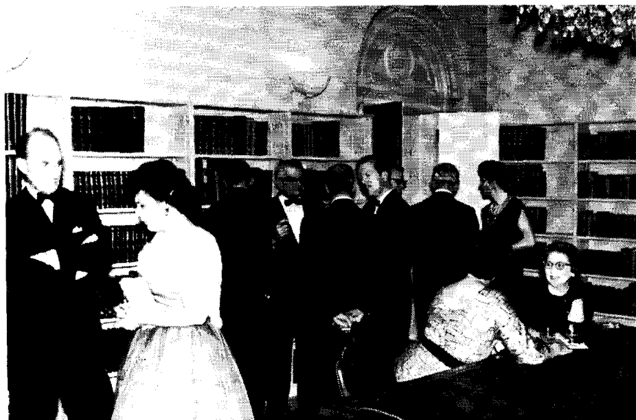
In the Library at the Faculty Reception, opening the first year of College in England.

English colleges may have large and ornate buildings, but they are bare and drab inside—just the plainest of furniture, usually two to six hundred years old—no color. One guest asked if I did not feel that these beautiful surroundings would be a deterrent to study and scholarship. British educators seem to have accepted a thread-worn tradition, which originated they know not when or where, that drab, unkempt, dreary