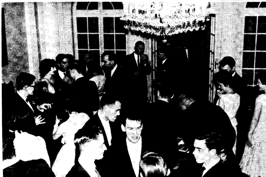
Looking onto the guests below in the Main Entrance Hall.

I explained that thirteen years of this more cheerful and pleasant way had proved, by experience, that it definitely is a vital influence in character building, and an incentive to study and do better work. I explained that Ambassador College follows neither British nor Ameri-