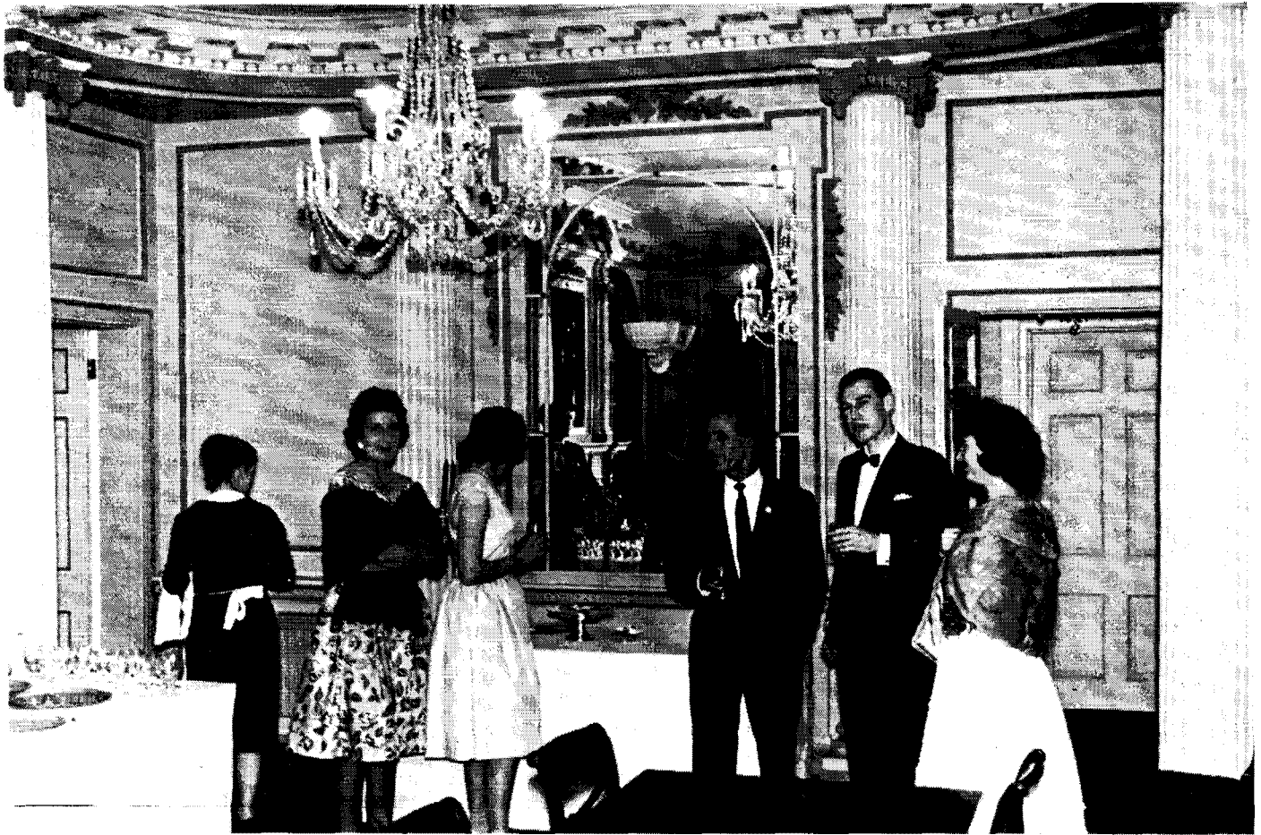
Enjoying a little punch at the Faculty Reception. Notice the gracious appointments of Ambassador's Memorial Hall.

vitaly needed ministers and other leaders for God's work here.