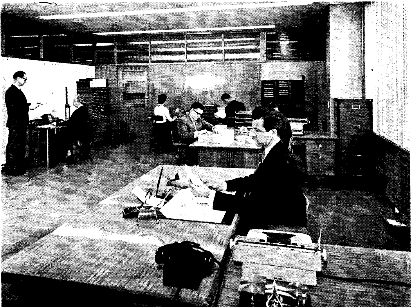
A partial view of the office staff at work in Sydney.

Australian visitors to the office see the far-flung stations which broadcast each night The WORLD TOMORROW.