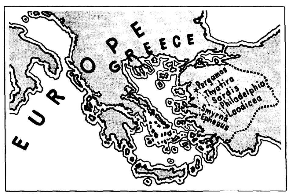
"Church at Pergamos": "I know thy works, and where thou dwellest, even where Satan's seat is: and thou holdest fast my name, and has not denied my faith" (Rev. 2:13).