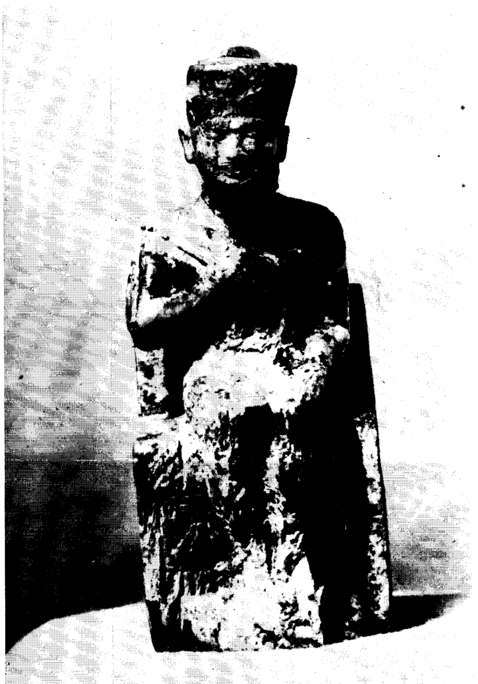
A badly damaged ivory statuette of Cheops from Abydos, Egypt. No other statues are known of him. The features of Cheops are distinctly non-Egyptian. Cheops built the great pyramid of Gizeh, near Cairo. It is the first and also the greatest pyramid ever built.

The Great Pyramid was built, according to Herodotus, over a period of about 20 years in the 3 months of each year during which the Nile overflowed and the people were idle. Its construc-