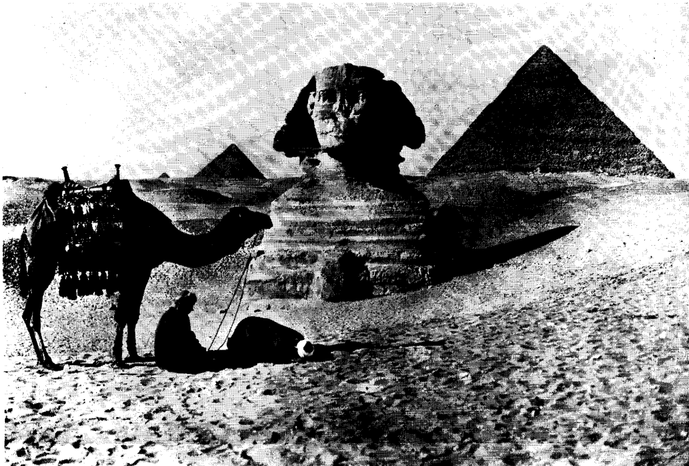
Arabs praying near the Great Sphinx before the sand was dug away from its base. The second largest pyramid is in the background to the right.

me men gave ear, and waited, and kept silence at my counsel. After my words they spake not again. . . . I . . . sat as chief, and dwelt as a KING in the army, as one that comforteth the mourners" (Job 29:21-25).