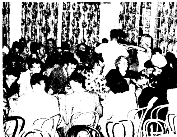
The dining room. Combined with the wonderful spiritual feast was this material feast—one of God's many bounteous blessings for which we were all thankful.