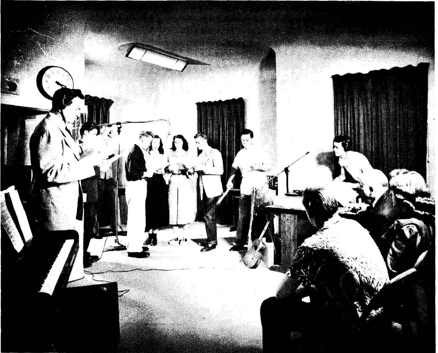
Broadcast Studio: Radio Drama being recorded.

the campus during the next five years. These plans contemplate erection of three new buildings and other changes, improvements and additions, which will provide Ambassador College with a truly fine and thoroughly adequate plant in every respect. Work is now proceeding on clearing and developing the new athletic field, adjoining the campus across Terrace Drive, to the east. We expect to have this in operation for softball by spring. The growth and development of Ambassador College during its four and a half short years is nothing short of miraculous.