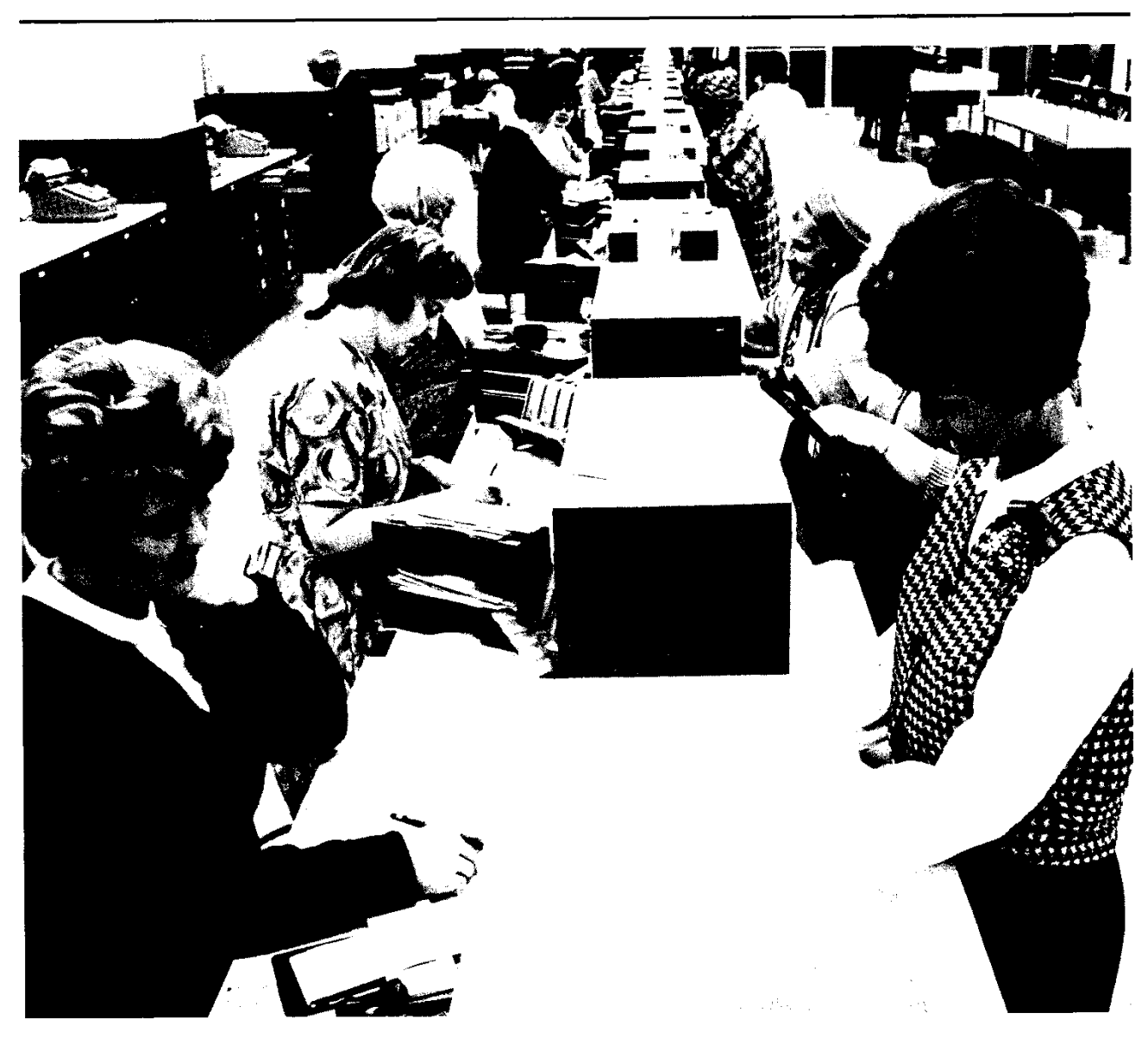
Savings — Vital Key to Financial Success