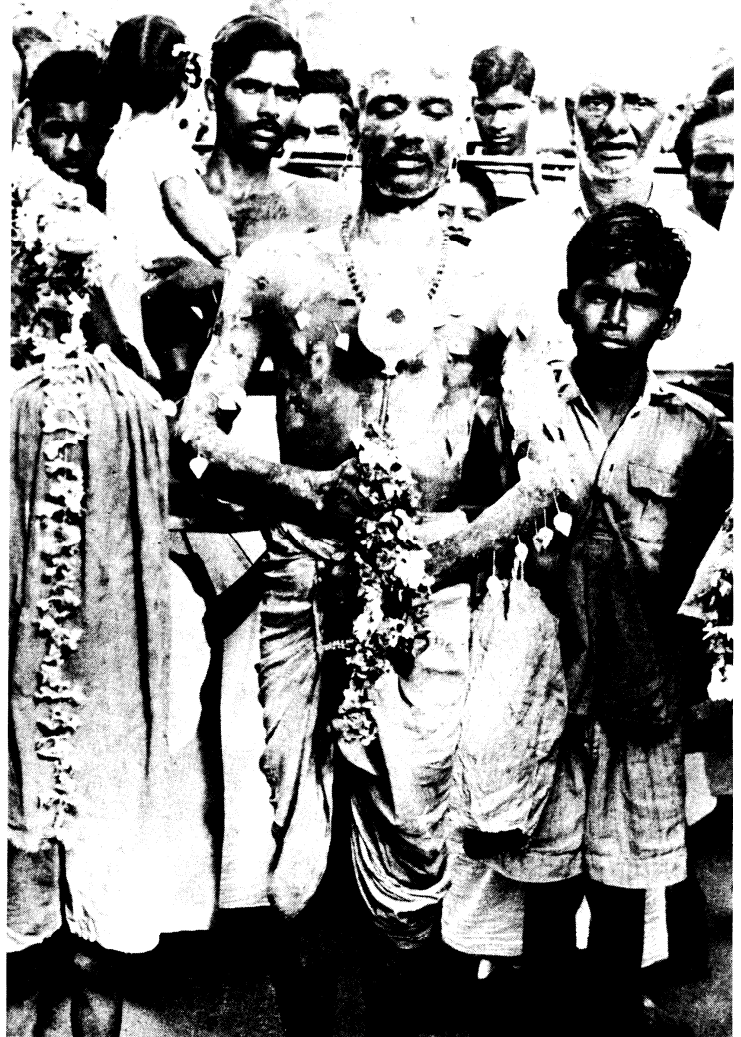
PENANCE — Body of devout Hindu in Madras, India, is pierced by shafts of tiny metal spears. Many today erroneously believe self-torture is pleasing to God and falsely assume fasting is penance.

COMMENT: In the Bible “ fast ” and “ humble ” often mean the same thing. Often it will be expressed “ he humbled himself before God. ” This means that he fasted before God! So when you see the command to humble yourself , it usually means to fast .