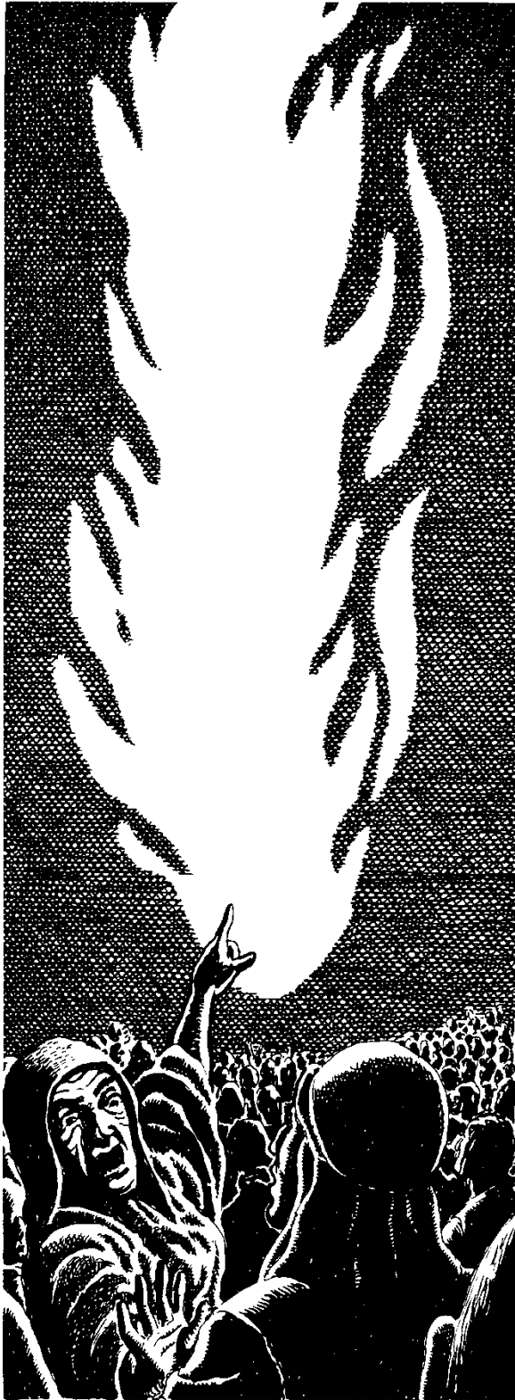
God miraculously appeared to faithless Israel as a pillar of fire by night, and a cloud by day—forty long years!