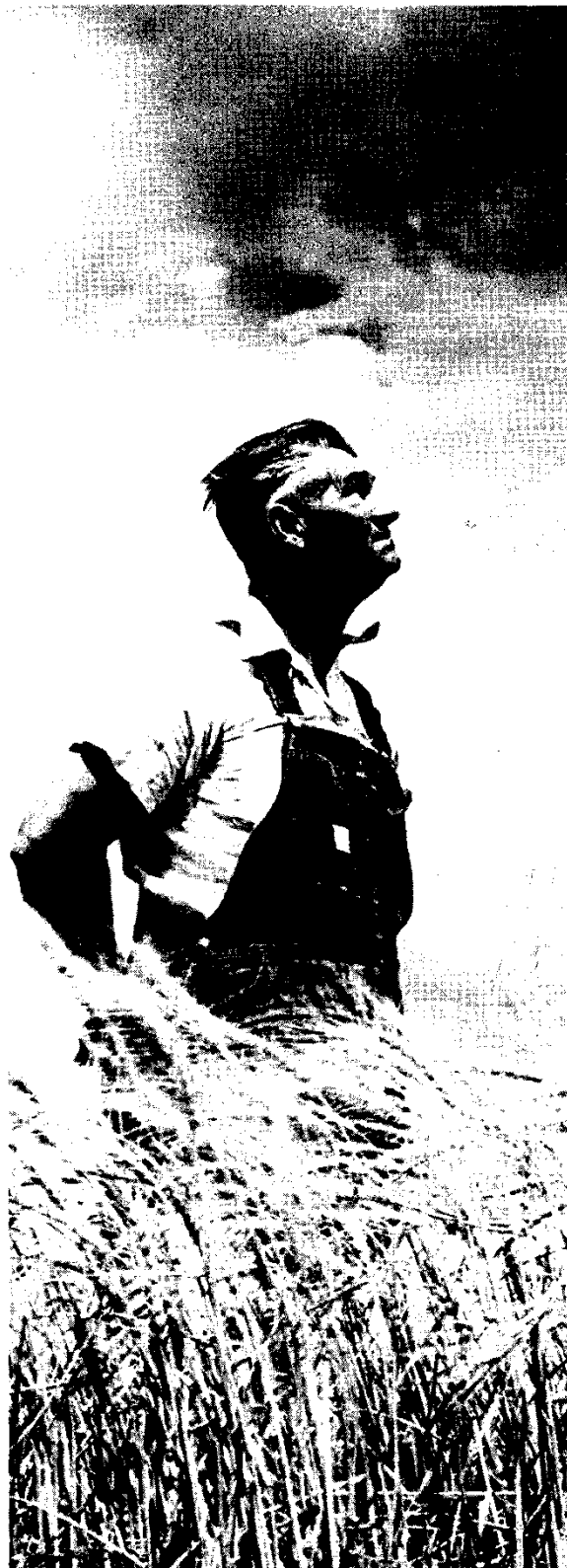
Bob Taylor Photo

5. Were Abraham's offspring to become extremely numerous? Gen. 13:16. When will