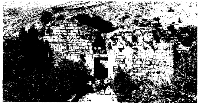
Dan, above, and Bethel, below, the areas where Jeroboam placed his golden calves.

COMMENT: Because of personal experience, the Holy Days now held graphic meaning for the few thousand Jews who returned from captivity.