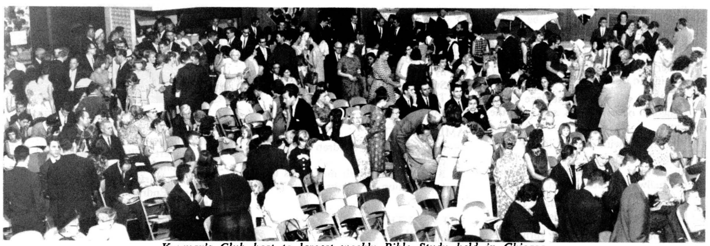
Keyman's Club host to largest weekly Bible Study held in Chicago.

Mr. Waterhouse explained how this re-development of existing buildings and lands fit in with God's overall plan. In the millenium, Israel will first be required to rebuild the devastated areas of the world before going into a full-scale building plan. It was wonderful to see how virtually useless and wasted areas were brought under control and developed to their full beauty as God intended.