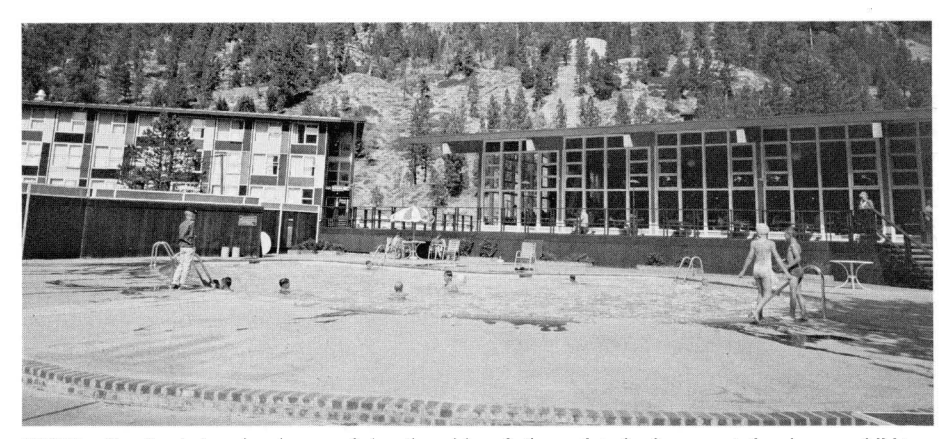
ABOVE—The heated swimming pool by the side of the cafeteria is a spot for happy children. BELOW—Large fur trees and rugged mountain slopes enclose the place where God has placed His name.