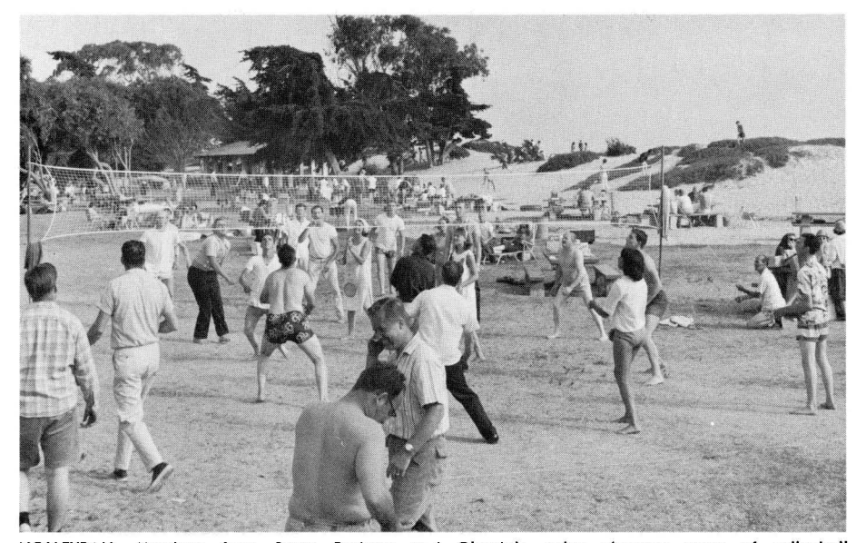
VOLLEYBALL—Members from Santa Barbara and Glendale enjoy vigorous game of volleyball during outing at Carpenteria State Beach.