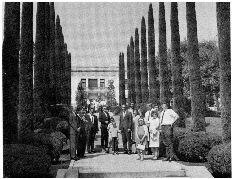
CAMPUS TOUR—Standing on the walkway to Ambassador Hall, Glendale members pause for a moment on eye-opening tour of college campus.