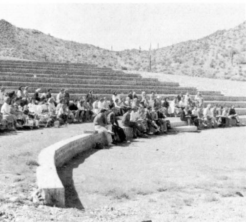
OUTDOOR SPOKESMEN —Phoenix men compete with wind and distance in unusual circumstances during recent club meeting.

While much of the nation shivered in rain, sleet, and snow, the Phoenix brethren basked (and burned) in the bright Arizona sun as the Phoenix Spokesman Club held its first outdoor meeting. Because of the adequate room and facilities, the entire Phoenix Church was invited to observe the meeting. A potluck lunch and picnic for everyone followed the conclusion of the Club session.