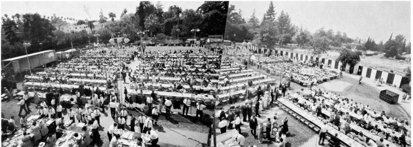
PANORAMIC VIEW—This composite of two photos gives you a revealing look at 3,000 headquarters area brethren feasting on the Ambassador College tennis courts, during recent holy days. Notice the large black

Brethren from San Diego to Bakersfield converged on the Civic Auditorium. There was "standing room" only at the Civic—as the many people had (Continued on page 3)