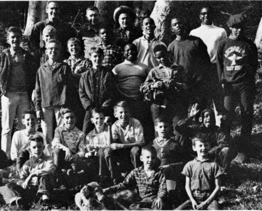
ALL SMILES—Recent outing produced these big smiles by Los Angeles Boys' Club members.