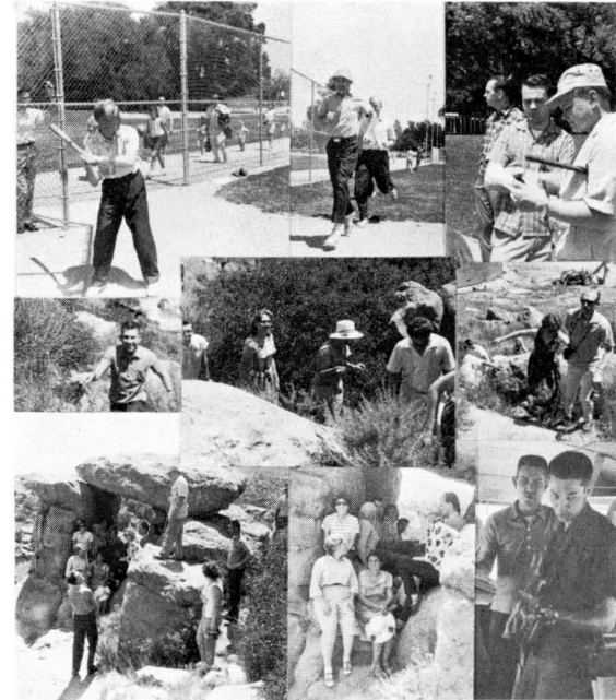
FUN-FILLED DAY—Single people enjoy all-day outing at Chatsworth Park.

Start to plan ahead now for the Feast of Pentecost, and make it our best feast ever!